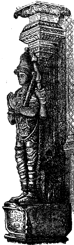
A PILLAR STATUE OF THE TEMPLE OF MADURA.

Showing the prayer attitude of the Hindus, both Brahmans and Buddhists.