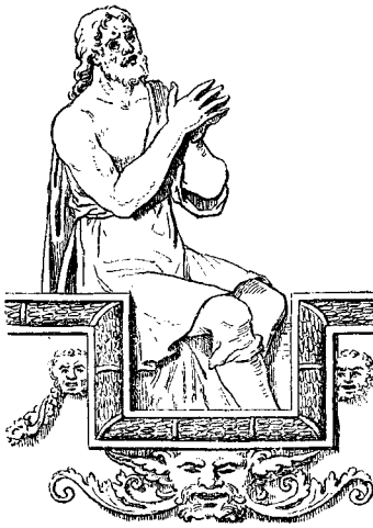
A CAPTIVE GOTH PRAYING. From the Triumphal Column of Theodosius the Great.

oldest MSS. of the Gospel of the Hebrews must have contained the five-prayered oration and that this was the form which Jesus, following an older tradition, taught his disciples; but if the more elaborate form of seven prayers already existed in Christ's time by the side of the briefer form, as we must assume on the testimony of Rabbi Jehuda's remark (quoted by Delitzsch), we can easily understand that some copyist added the third and the seventh prayers, and, once established, the seven-prayered oration alone seemed complete. While thus the five-prayered form was alone known during the first and second centuries among Gentile Christians, we are well assured that the introduction of seven-