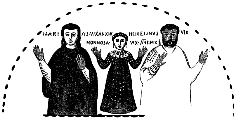
CHRISTIANS PRAYING. Decoration of the Catacombs.

"A man should never pray for his necessities in the first three prayers and not in the last three prayers, but in the middle one ; for, as Rabbi Chanina says, in the first three prayers he must be like the servant and expatiate in praise of his Lord."