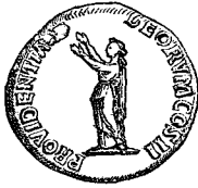
A COIN OF PERTINAX. Exhibiting a woman praying.

“ ‘Our Father and King’ is the ancient New Year's call of the synagogue, and in the ten penitential days of the atonement-festival Rabbi Eliezar replied to the question, How must a prayer be which should be brief :