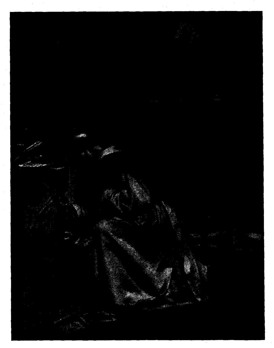
SAVONAROLA PRAYING IN HIS CELL. (From Castelar.)

saint of one of the wealthiest, most cultured, and most powerful cities of Europe. The city of Florence, licentious and Godless be-