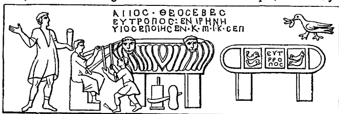
THE TOMBSTONE OF EUTROPUS.

ΣΕΒΕΣ ΕΥΤΡΟΠΙΟΣ ΕΝ ΙΡΗΝΗ. ΥΙΟΣ ΕΠΙΟΙΗΣΕΝ. 1 Κ. Μ. Ι. Κ. ΣΕΡ, which means: "The Sainly and God-fearing Eutropos. His son made it" (i. e., the tombstone). The concluding letters are the date. Eutropos, assisted by an ap-