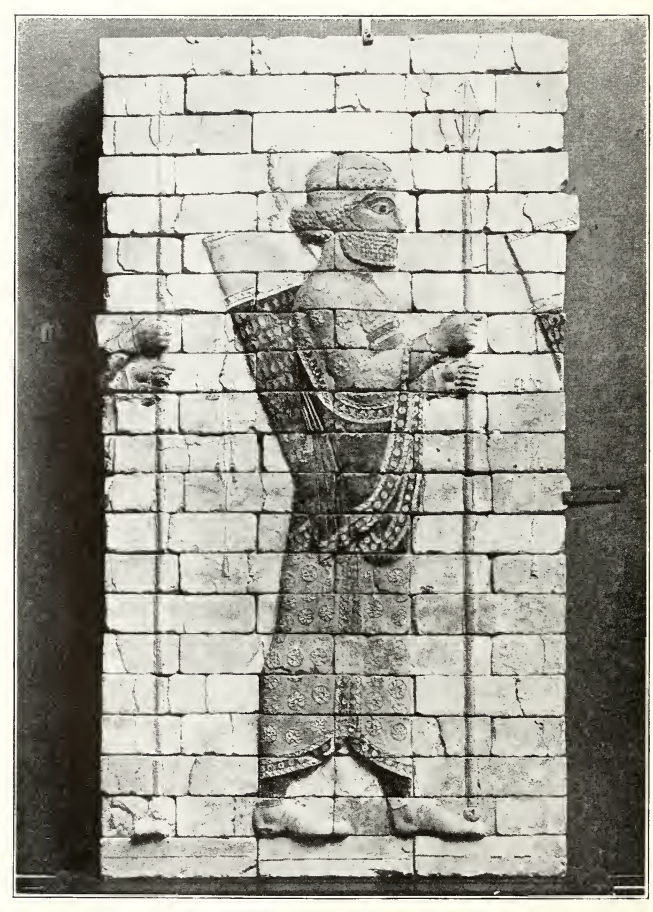
ARCHER IN ENAMELLED TILES. Susa. From the Palace of Darius, Fifth Century B. C.