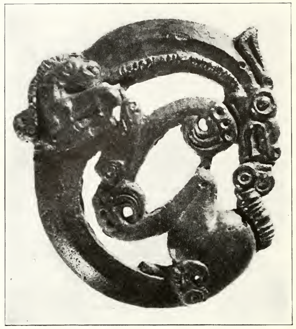
BRONZE HARNESS (?) ORNAMENT CRIMEA.

A typical example of the art of outer Iran, A mare twisted around to bite her tail with a foal alongside. A vivid expression of viality and at the same time a powerful and original pattern.