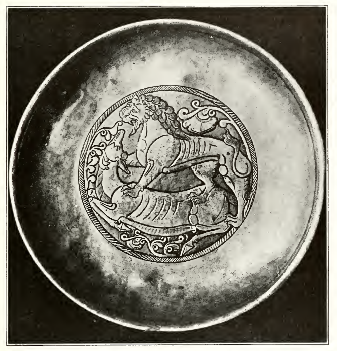
SILVER PLATE—SASANIAN

centers are given: for example, a circular or square basin is posed vertically at the foot of the panel, and a richly ornamented canopy is set obliquely, in the upper part, and all around there is a circling dance of objects and personages so arranged that the two spheres of action thus created are fused and by their persuasive poetry induce the eye to create a mobile prrspective (for example, the beautiful scene of the presentation of the portrait of Khosru to Shirin, in the famous manuscript of the Shah Tahmasp period, painted between 1539 and 1543, illustrating the poems of Nizami which is in the British Museum).