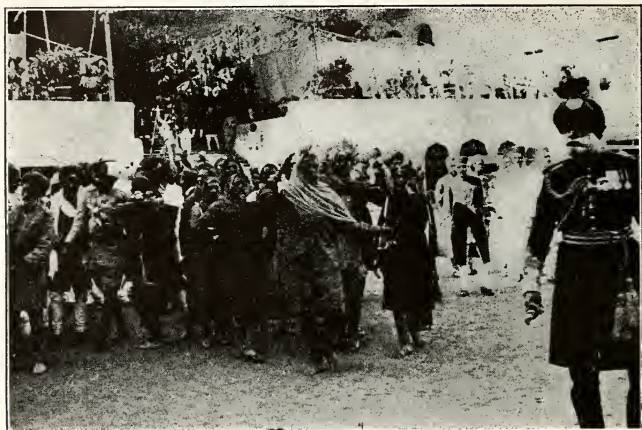
All Rights Reserved

The State Procession ended the celebration of wedding festivities at Patiala, and now all set out by private train to Seraikella, the bridegroom, his family, ministers of state, and all the guests. A magnificent welcome awaited them at the Sini Railway station. The representatives of the Prince were escorted to the Seraikella Fort where the formal request for the hand of the Princess was made and granted. The Prince waiting in an antechamber was notified of