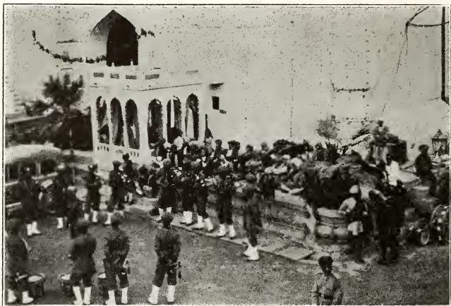
All Rights Reserved

No written records of marriages are kept in India, nor was any written announcement of the approaching marriage made by the Maharaja. But, in order to acquaint his subjects with the desire of his son to wed the Princess of Seraikella in such a way that they might bear witness to it by eye and ear, a magnificent spectacle, the State Procession was arranged. Following certain religious rituals at the Fort, the Prince garbed in glittering gold brocade started for