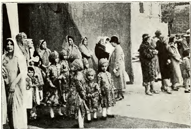
All Rights Reserved

When the Procession approached the gates of Motibag Palace, the mahouts were given a signal to halt the elephants, and the bride-