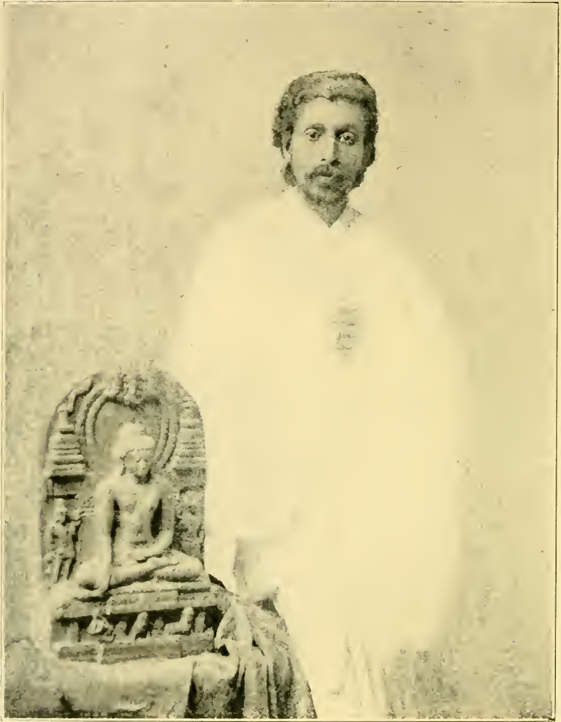
THE VENERABLE A. H. DHARMAPALA

The Venerable Anagarika H. Dharmapala, the greatest figure in the renaissance movement in Buddhism and the founder of the Maha Bodhi Society, passed away on April 29, 1933, at the "Mulagandhakuti Vihara", the Buddhist temple which he built at Isijatana, Sarnath, Benares. It was here that Buddha preached his first sermon after his enlightenment, and here the Venerable Dharmapala was admitted into the holy order of Bhikkus in January of this year. Dharmapala was one of the most distinguished of the delegates to the World's Congress of Religions held in Chicago in connection with the Columbian Exposition of 1893.