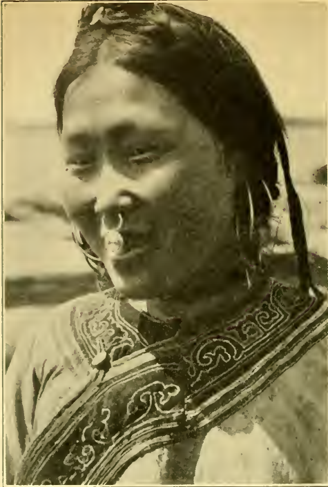
GOLDI WOMAN WITH EARRINGS AND NOSE RING

In 550 the Turks of the Altai country defeated the White Huns and became masters of the country. The subjugated Aryan population not only had a new language superimposed upon its own, but underwent an admixture of Turkish blood. At the close of the seventh century, the Arabs conquered Turkistan and forced its conversion to Islam. In 1219 Jenghis Khan ravaged the country like a terrible hurricane, and at the end of the fourteenth century Timur established his rule. He chose Samarkand as the capital of his empire and made it