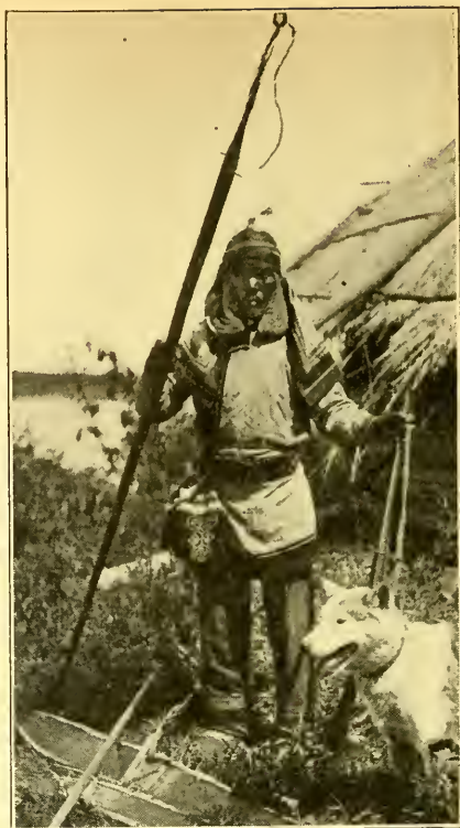
A GOLDI EQUIPPED FOR WINTER HUNTING

The population of the Russian Far East is extremely heterogeneous. The Tungus, again, as everywhere in northeastern Asia, form a considerable portion of the aborigines, and live in the Amur region. The Manchus reside in small numbers in the towns along the Manchurian boundary line. With the exception of the civilized