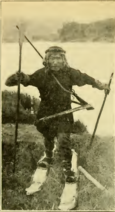
AN OROCHE EQUIPPED FOR WINTER HUNTING

Manchus all these tribes are primitive hunters and fishermen. The extreme northeast of Asia and Kamchatka is inhabited by the Gilyak, Ainu, Chukechee, Koryak, Kamchadal, Yukaghir, Chuvantzi, Asiatic Eskimo, and Aleut. All these peoples are known in the modern classification as the Americanoids of Siberia. In their language, religion, culture, and in bodily characteristics they are closely related to the American Indians. It is believed by anthropologists that all these peoples reemigrated from America into Asia at the end of the last glaciation.