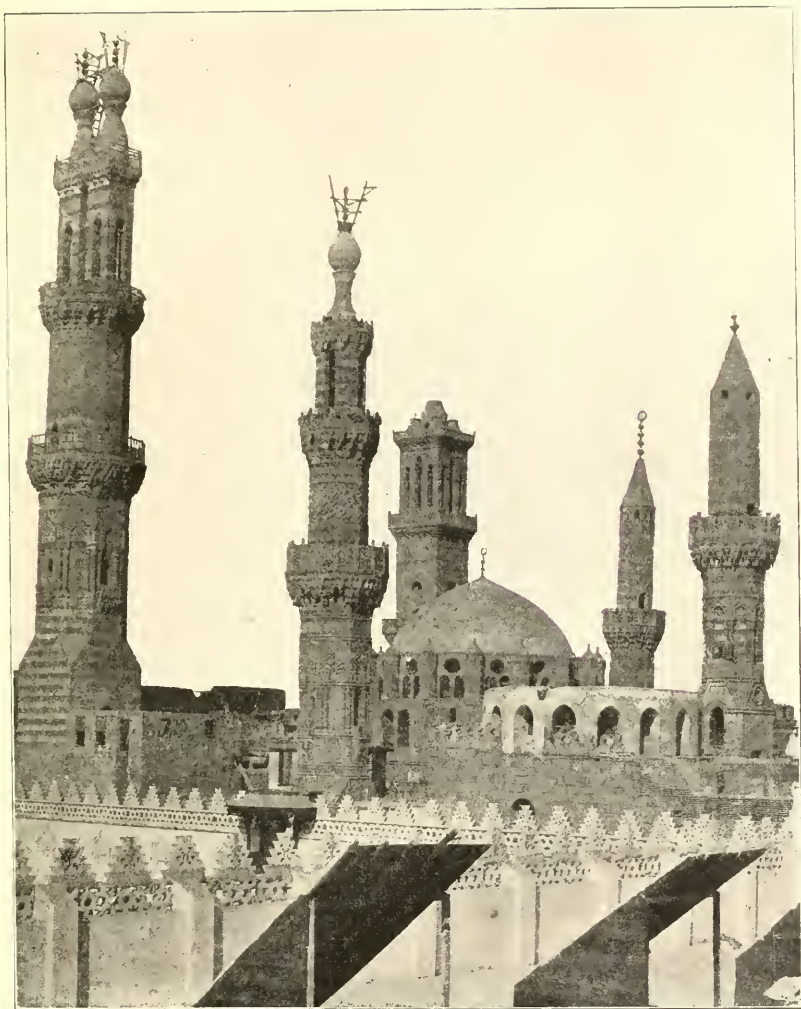
AL-AZHAR MOSQUE AND UNIVERSITY