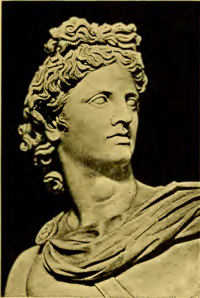
DETAIL OF THE APOLLO BELVIDERE

they see it, the gods point out to him how far he may go and he checks himself and obeys them. Now, if this was the purpose of this god, could it be that the purpose of Homer was not to show this . . . a moral and a religious purpose?