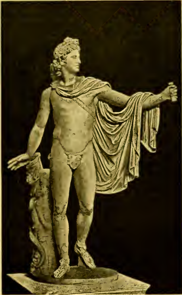
THE APOLLO BELVIDERE.

the sun could shine in over deliberations and no shadows would darken counsel. In general, and in little, every village Agora, the Marketplace, was a Delos, a Delphi where those inspired by the