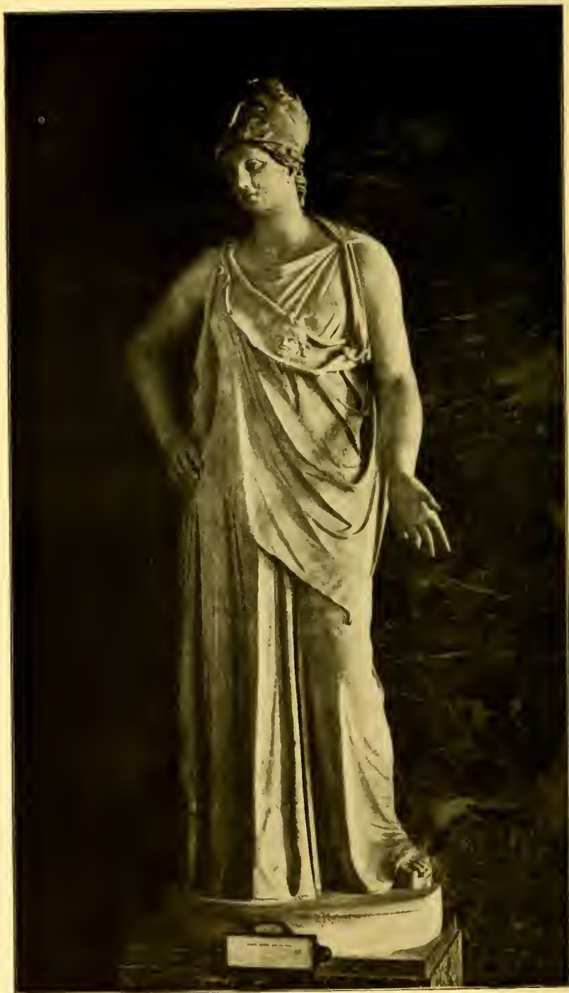
THE ATHENE OF PEACE. In the Louvre.