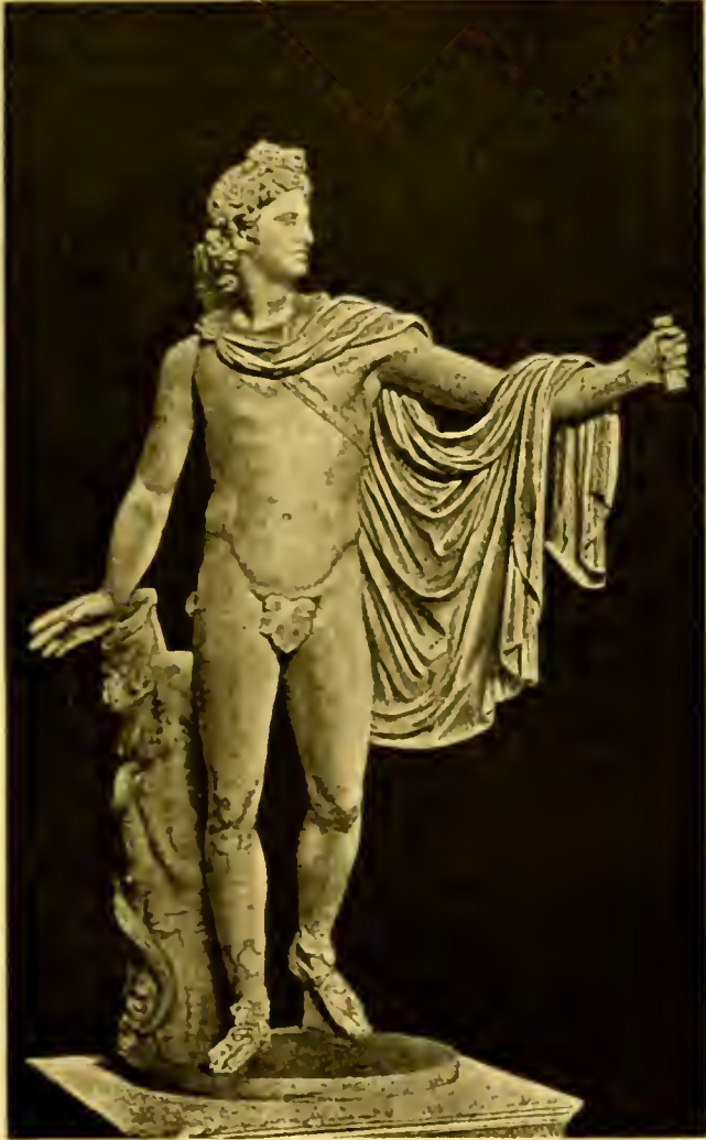
THE APOLLO BELVIDERE.

the sun could shine in over deliberations and no shadows would darken counsel. In general, and in little, every village Agora, the Marketplace, was a Delos, a Delphi where those inspired by the