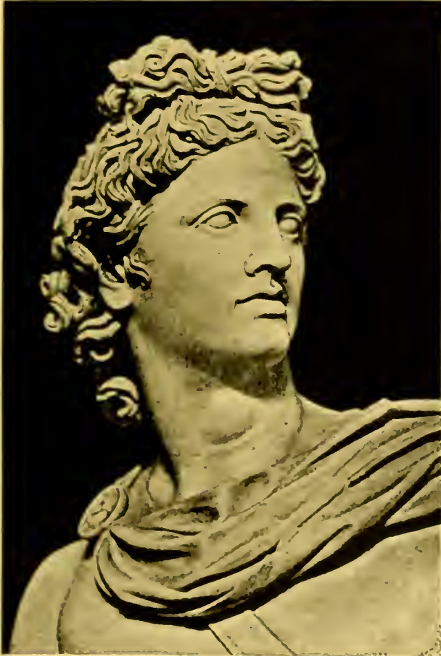
DETAIL OF THE APOLLO BELVIDERE

they see it, the gods point out to him how far he may go and he checks himself and obeys them. Now, if this was the purpose of this god, could it be that the purpose of Homer was not to show this . . . a moral and a religious purpose?