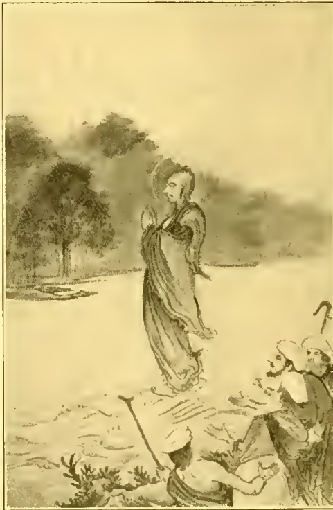
BUDDHA WALKING ON THE WATER