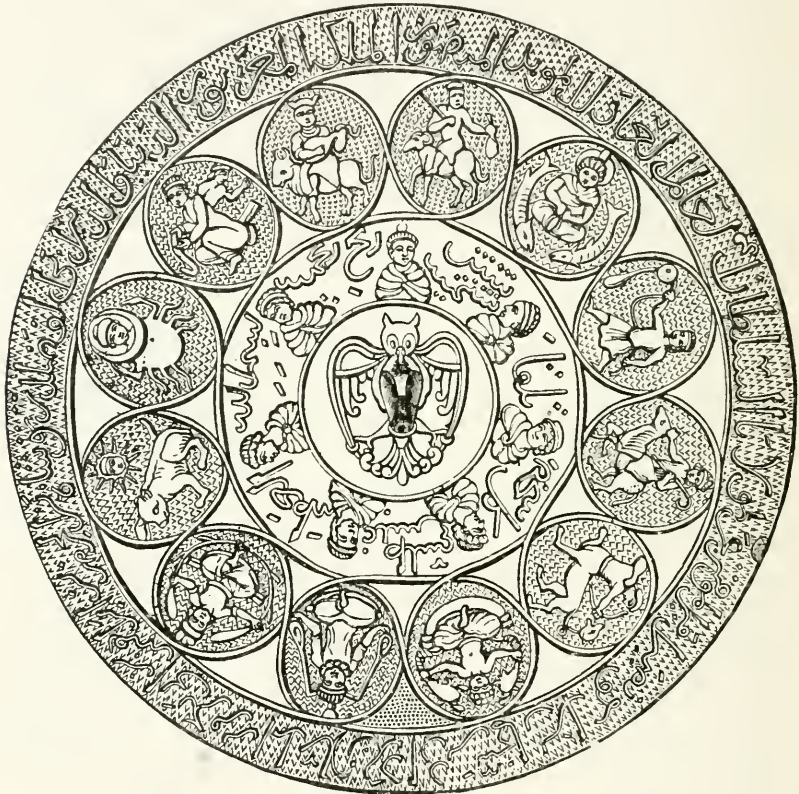
ANCIENT ARABIAN ZODIAC (13th Century)

having left their father Zebedee in the ship with the hired servants, they went after him." Matthew follows in substantially the same words, adding that Simon "is called Peter" (iv. 18-22), while Luke (v. 1-11) omits Andrew and combines the story of the call with that of the multitudinous draft of fishes—doubtless recognizing the possibility of a metaphorical application of both stories; which are certainly presented primarily as literal truth. Again, the story of Mark