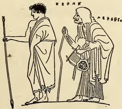
A GREEK YOUTH ACCOMPANIED TO SCHOOL BY HIS PEDAGOGUE. FROM A VASE PAINTING.

The afternoon presumably found the boy in the palaistra or game school, where running, jumping, hurling the spear, throwing the discus and wrestling were the chief activities. Through these