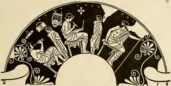
GREEK MUSIC SCHOOL, FROM VASE PAINTING, ABOUT 450 B.C.

Religious influences surrounded the child from his earliest years. On the fifth, or according to some authorities, on the seventh day, after birth (14:297) by a ceremony known as the Amphidromia (17:72-73; 11:122) he was placed under the protection of the household gods. A father had the right to refuse to rear a newborn child, in which case the infant would be "exposed", i. e., secretly left in some public place within the city to starve unless rescued by some passerby, or carried outside the city to some desert spot to die of exposure or to become the prey of wild beasts. 6 If accepted by the