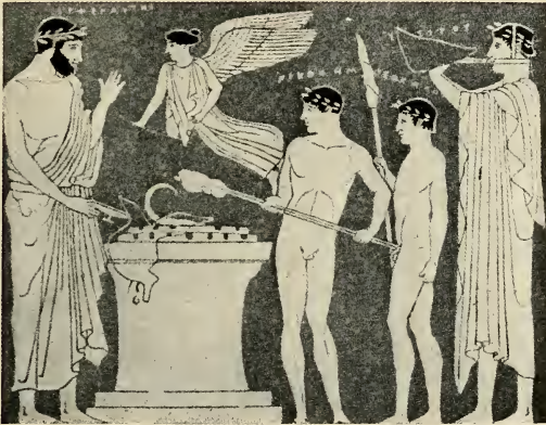
ATHENIAN RED-FIGURED VASE PAINTING. STAMNOS, BRITISH MUSEUM.

Athenian families, living in the midst of a slave population, were unwilling to trust their sons away from home during the long school day unless supervised by someone directly responsible to the household. As soon as the boy began attending school, a slave known as the paidagogos (lit. child-leader) was appointed to accompany him to and from school, to carry his school books and lyre, to remain with him throughout the day, to guard him against evil influences and to see that he conducted himself virtuously and