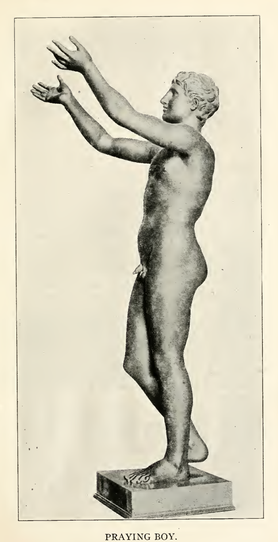
Bronze of the latter part of fourth century B. C. Now in Berlin.