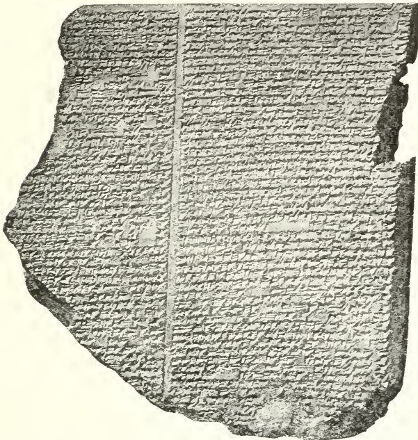
THE CHALDEAN ACCOUNT OF THE DELUGE.

For seven days and six nights the wind blew and the deluge and tempest overwhelmed the land. When the seventh day drew