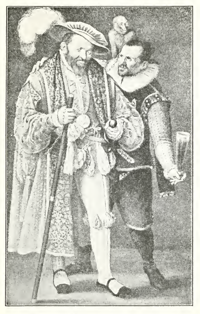
PARACELSUS WITH A BOON COMPANION.*

"I wish to admonish all physicians that they scrutinize, not me to whom they are hostile, but themselves and then they may judge