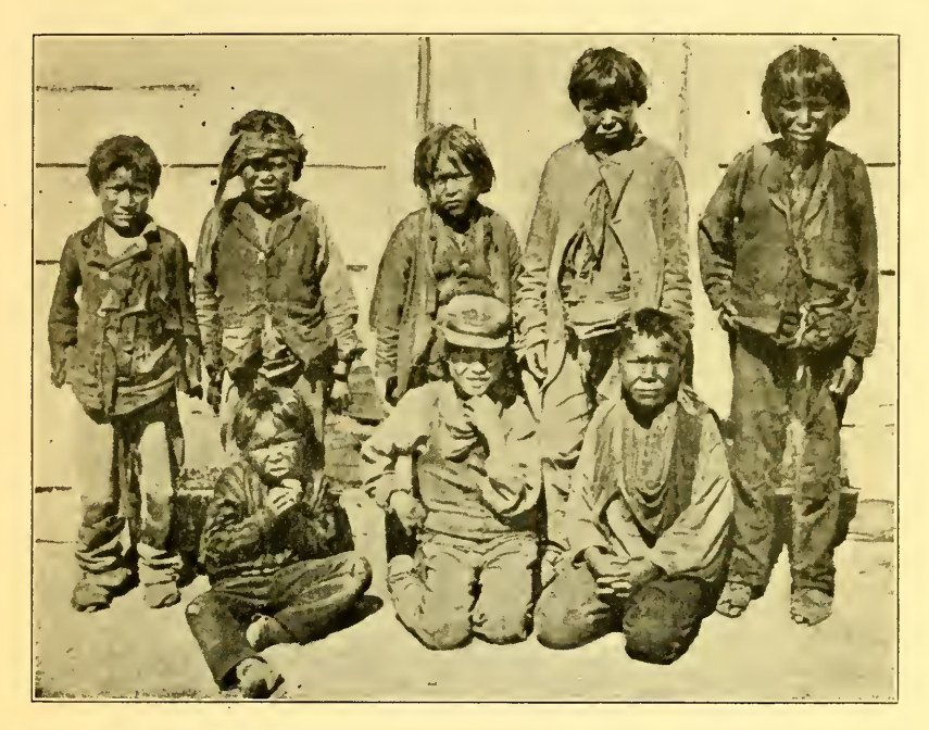
Fig. 40. GROUP OF DENE INDIANS—DOG-RIBS OF GREAT SLAVE LAKE—IN EUROPEAN CLOTHING.

The introduction of European schools and methods of education has resulted in the production of a special brand of cultured