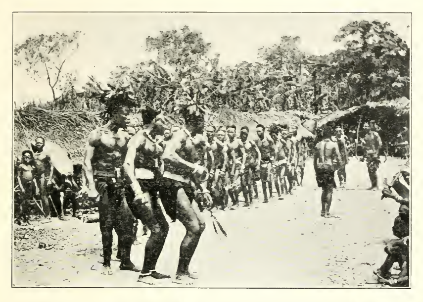
Fig. 35. FUNERAL DANCE AT UPOTO, UPPER CONGO.

On the death of an adult, the natives of the Upper Congo, male and female, dress themselves up in all their finery and walk in single file round and round the grave, singing and shouting the praises of the dead as they go, the whole village looking on. When passing the hut of the dead person, they plunge their spears into the roof, apparently to frighten away the ghost. This dance lasts from eight