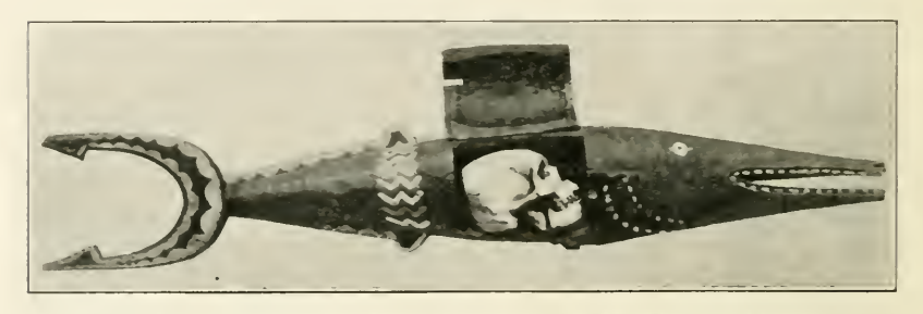
Fig. 34. "FISH-COFFIN" OF THE SOLOMON ISLANDERS. British Museum.

Many Indians of America cremate the dead. The body is kept in a lodge for a few days. At the end of that period it is laid upon logs which are then ignited. Beside this pyre the widow must sleep for nine days, from sunset to sunrise. While the corpse is being consumed the widow collects some of the juice from the body and rubs it on her own body and face. The bones are afterward collected and carried about for a period of years corresponding to the depth of her affection (see Fig. 38). At the end of this period, a certain ceremony, lasting some months, is performed in order to remove her mourning. The bones are taken off her back and fastened to a post. She is praised for being a good and faithful wife: bird's down and oil (see Fig. 39) are put on her head, and she is then at liberty to marry again.