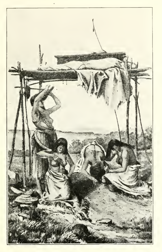
Fig. 36. SIOUX WOMEN, CUTTING THEIR HAIR AND MUTI-LATING THEIR BODIES AT THE GRAVE.

with a tomahawk, while the mother burns her breast and abdomen for hours and hours at a time, frequently with such severity that fatal results ensue. In other cases, women dig their sharply-pointed yam sticks into the top of their heads until blood falls in streams