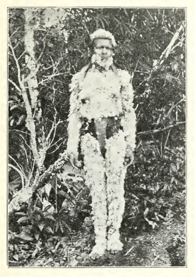
Fig. 39. BORORO INDIAN WOMAN WITH BODY COVERED WITH FEATHERS.

man. The fear of the dead man's ghost, and the desire to proputate it by all means; the devices and deceptions practised to mislead it; all these and the customs arising therefrom, form the very basis upon which savage ethics have been built. For if a man be offended in any way during life, he will threaten the offender that he will