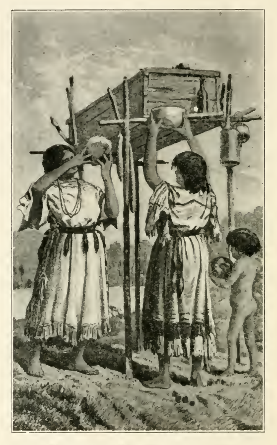
Fig. 37. NORTH AMERICAN INDIANS OFFERING FOOD TO THE DEAD MAN'S SPIRIT.

to bring them wealth and strength. They consider the closer the hair is cut, the greater is the sign of mourning. The Loucheux cut the hair close to the head, and sometimes, in their frenzy, kill some poor friendless stranger who may be sojourning with them.