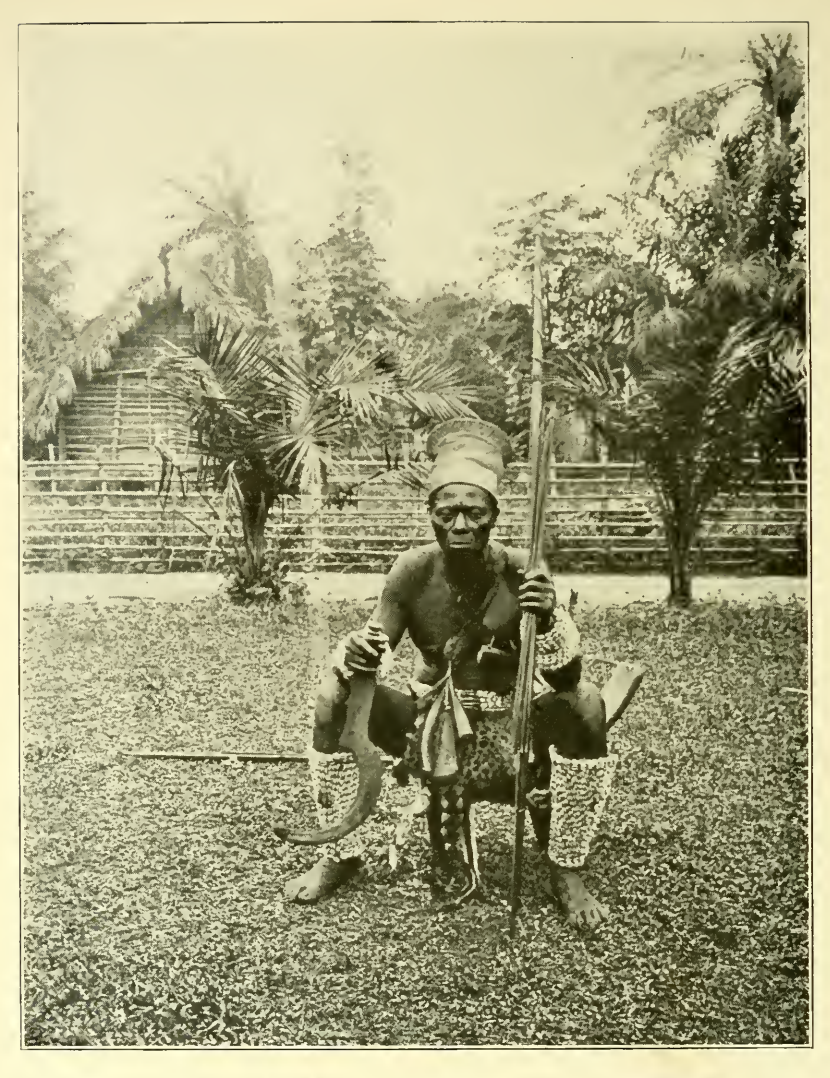
CHIEF OR MEDICINE-MAN OF IKOLO, LAKE NTOMBA, UPPER CONGO.

Showing full regalia of cowrie shells etc.