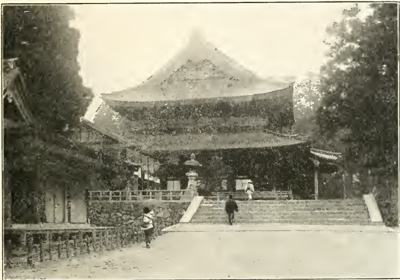
THE KONDO, THE CHIEF SANCTUARY OF KOYASAN.

Beside those above mentioned, there is a large number of splendid wooden sculptures, as the Shingon sect of Buddhism, to which the Koyasan monastery belongs, has given fitting and plastic