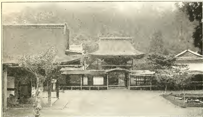
THE KONGO SAMMAI-IN, ONE OF THE OLDEST TEMPLES.

Kobo Daishi, the founder of the monastery, who died in 834