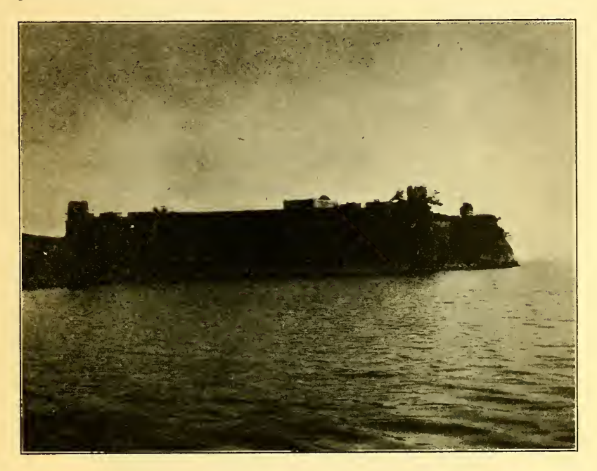
THE SPANISH FORT AT TAY TAY.

In passing out of the harbor of Tay Tay we visited a small volcanic island of curiously weathered and water-worn limestone. Except for a narrow beach the sides of this island are almost perpendicular, and the cliffs are honeycombed with dozens of water-