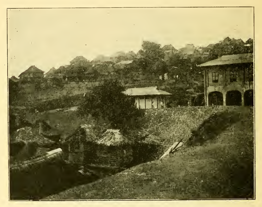
CONCRETE DORMITORY AND NATIVE SHACKS.

Fine concrete dormitories are supplied, but many prefer to build their own native houses of nipa palm and bamboo. A certain amount of help is given the lepers in building these houses on con-