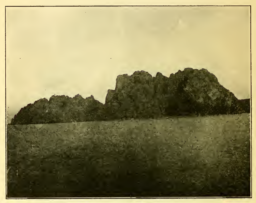
ISLAND NEAR TAY TAY WHERE EDIBLE BIRDS' NESTS ARE FOUND.

Including the dock a few acres of the island are fenced off, and into this enclosure the lepers are forbidden to enter; otherwise they