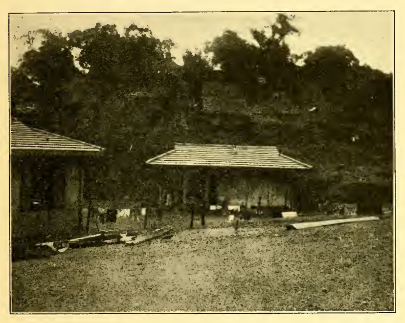
CONCRETE KITCHEN AND LAVATORY BUILDINGS AND NATIVE RESIDENCES.

A large number of the patients who are in the incipient stages showed, to the ordinary observer, no effects of the disease. There were others who at first glance seemed perfectly normal, but on closer scrutiny revealed the absence of one or more toes or fingers. Others had horribly swollen ears; some had no nose left and were distressing objects; but it was not until we visited the various wards of the hospital that we saw leprosy in all of its horror. Here were