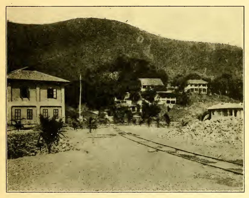
DOCTORS' RESIDENCES AND OTHER BUILDINGS OUTSIDE OF THE BALCONY FENCE.

Passing this minute store we entered the gate of the "forbidden city," and, though there is no danger from merely breathing the same air with lepers, it gave us a rather strange sensation to be surrounded by thirty-four hundred poor wretches who in Biblical times would have been compelled to cry "Unclean! unclean!" We,