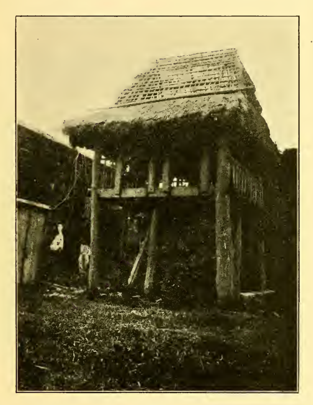
BELL-TOWER OF THE CHURCH OUTSIDE OF THE FORT.

To those of us who lead busy lives in the centers of what we call twentieth-century civilization, life in a place so isolated from the rest of the world as Tay Tay seems impossible. Yet the inhabitants of this barrio are quite contented and fairly comfortable. They live "the simple life" indeed. While their resources are