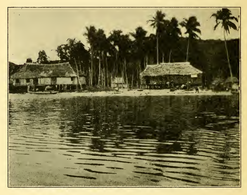
TWO PROMINENT HOUSES IN TAY TAY.

Within the fort and overlooking the walls is an old stone church whose roof has long since fallen in. Within the fort is also a large cement-lined, stone cistern to hold water in case of siege. The Spanish inscriptions on the walls show that the fort was begun about 1720, though the mission there was established about 1620. Lying about within the fort are a few large iron cannon that were doubtless used by the Spaniards in repulsing the attacks of the