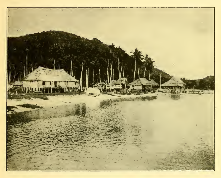
VILLAGE OF TAY TAY FROM THE HARBOR.

Early on the second morning we entered the harbor of the small but ancient village of Tay Tay (pronounced "tie tie" and spelled in various ways) on the eastern shore of Palawan. Not a white man lives in this inaccessible hamlet and it is seldom that one visits