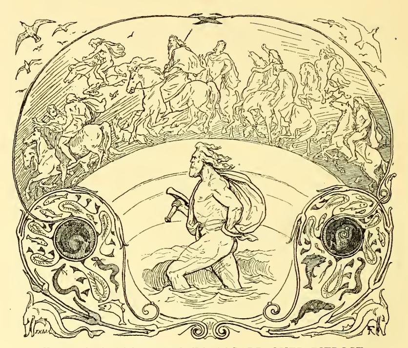
THE ASAS ASCENDING TO ASGARD OVER BIFROST.

But Loke does But Loke relents not, and speaks not, not relent, Save when, her cup overflowing