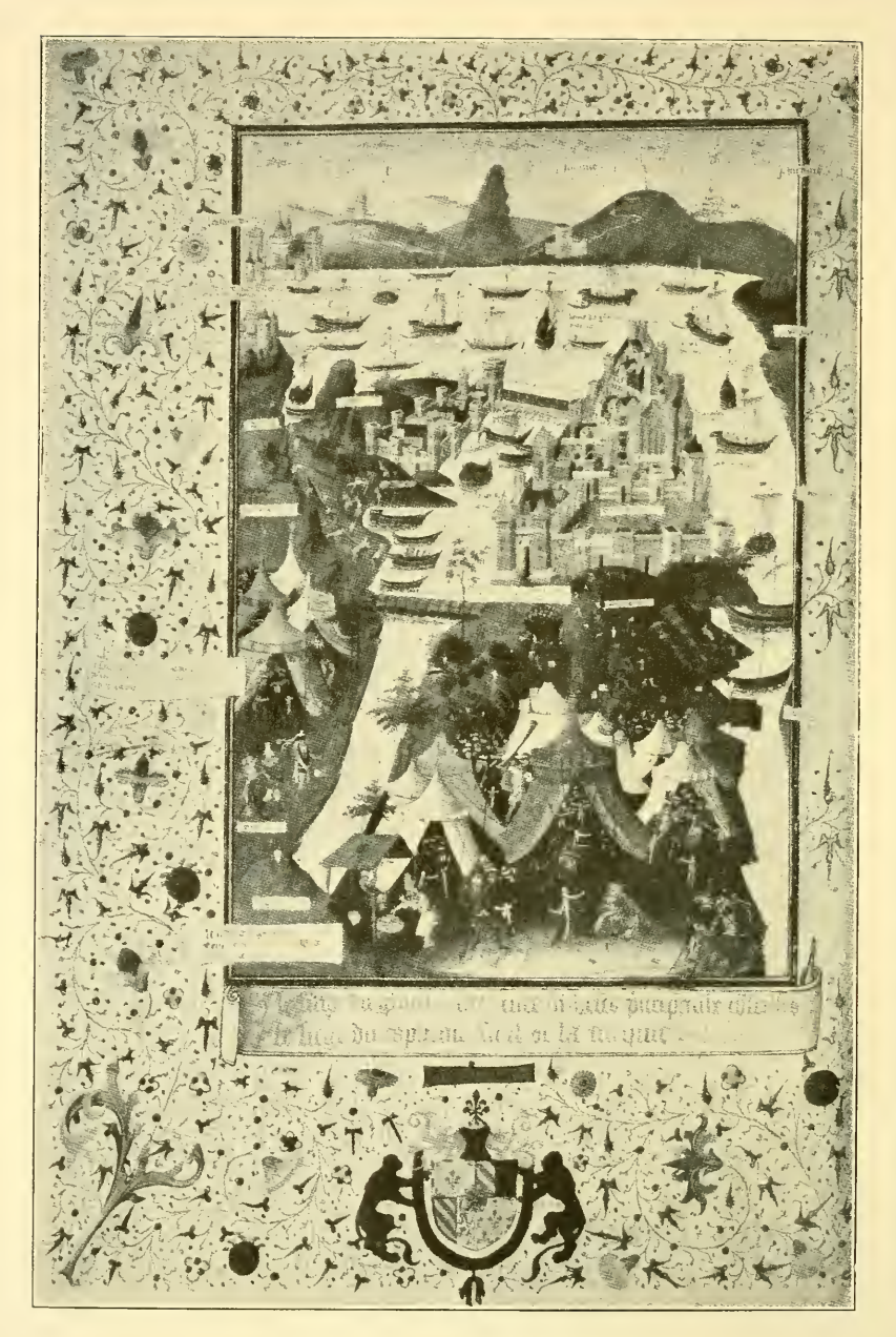
THE SIEGE OF CONSTANTINOPLE. From a 15th century book in the National Library at Paris.