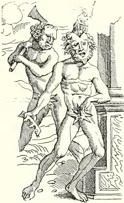
THE BIRTH OF WISDOM.

Luther, but only theoretically, so that consequently his position was somewhat ambiguous. To him the Reformation was as unsatisfactory as the traditions of the orthodox church. He thought for a while that he could gain the friendship and alliance of the reformers, but they were vigorously opposed to anything that was not devout Christianity, and so his attempts at coming to an understanding with Luther naturally and necessarily failed. Erasmus's work is of immense value to New Testament scholars. A man like