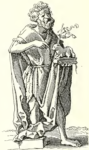
ST. JOHN THE BAPTIST.

The one-armed cap-a-pie, the other with syllogism and arguments; both fighting for tithes and power over the people.