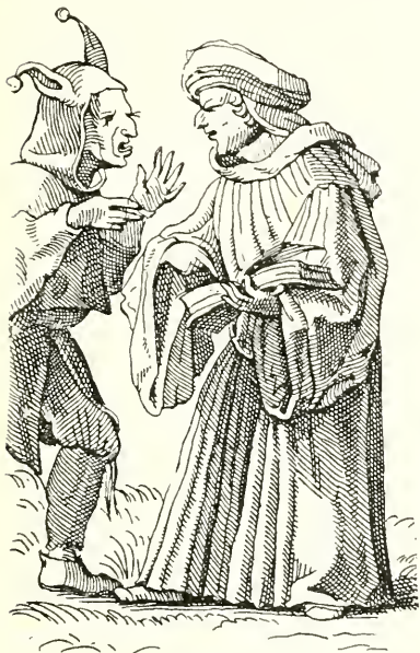
THE FOOL AND THE WISE MAN.

“Erasmus is very pitiful with his prefaces, though he tries to smooth them over; he appears to see no difference between Jesus Christ our Saviour, and the wise pagan legislator Solon. He sneers