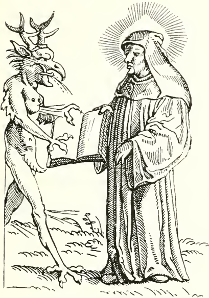
THE DEVIL AND ST. BERNARD. The Devil promises that by repeating daily seven verses from the Psalms Heaven may be won.

for Erasmus was fond of having pictures of himself made for his friends. In 1524 the latter sent two portraits to England and a third to France—all three by Holbein. Besides these Holbein made the drawing for a woodcut which shows Erasmus in full figure im Gehäus , that is, in a rich Renaissance frame. The small circular portrait which we reproduce as our frontispiece was probably painted in 1530, and belongs to the Amerbach collection. It has