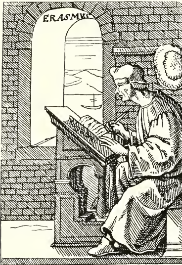
ERASMUS WRITING THE "ADAGIA."

All that is known of the history of this volume is that it may have belonged at one time to Erasmus himself, or to the printer who used to employ young artists to make drawings, title-pages and other suitable embellishments for books: Among these young struggling artists of that time was Hans Holbein. It is supposed that a copy of the book was lying on the printer's table and fell