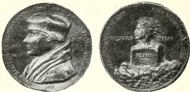
MEDAL OF ERASMUS IN 1519, WITH HIS MEMENTO MORI DEVICE

"Mortal man! (for so I address thee, even on a throne) dost thou exult at hearing the rumor of an ensuing war? Check thy joy