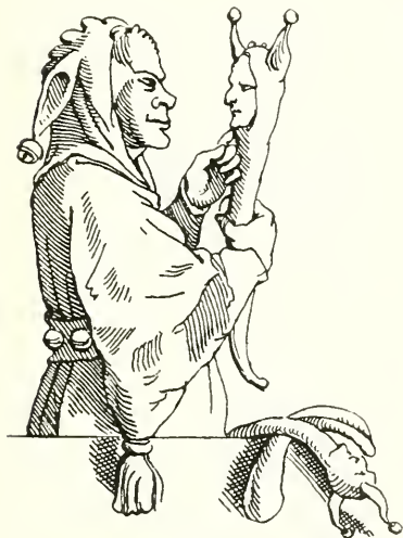
FOLLY TALKING TO HER PUPPET.

Luther appears in these comments in all his narrowness, but it would be a great mistake if we judged Luther from the modern standpoint of breadth. It was because of his very narrowness that Luther was great. If he had not been possessed of that narrow-minded courage he would probably not have taken the stand he did before the Diet of Worms, and would not have been a fit man for his work in history. There he stood and faced very probable death