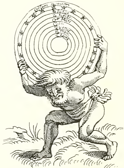
ATLAS SUPPORTING THE WORLD.

“To wise men she is always stingy and sparing of her gifts, but is profusely liberal and lavish to fools.”— Erasmus .