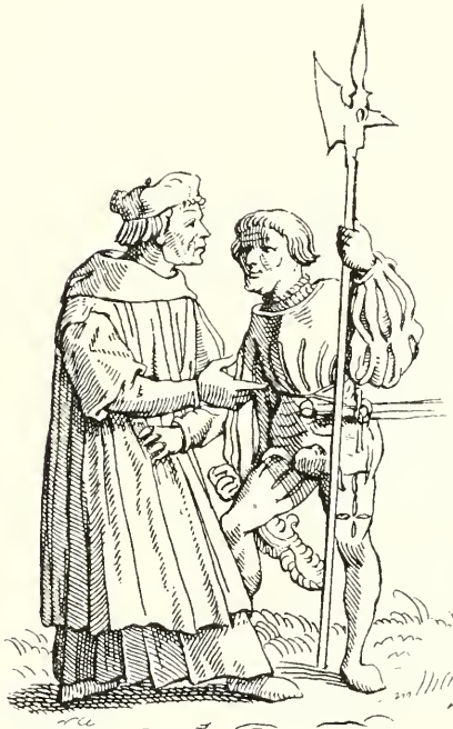
THE SOLDIERS OF CHRIST.

of evidence, especially that which arises from a personal pique and resentment, how happens it that in a business of far more consequence to human nature even than courts of judicature, in an affair the most odious and abominable, such as the promoting discord among human creatures and whole neighboring nations, causes the most frivolous and vexatious are freely admitted as competent and valid? Let the lovers of discord and the promoters of bloodshed between nations divided only by a name and a channel rather reflect