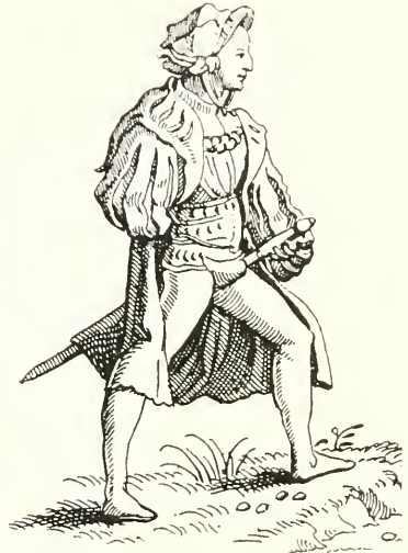
THE COURTIER PRACTISED IN DISSEMBLING.

"To feign the fool when fit occasions rise, Argues the being more completely wise."— Horace .