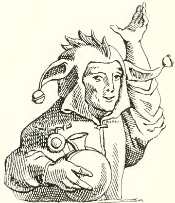
FOLLY IN CAP AND BELLS.

Addressing her praises to the fools among men.