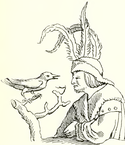
THE SYMBOL OF THE HOLY GHOST.

The book contains annotations in Molitor's handwriting, and from one of them it is learned that the illustrations were done in 1515. The questions as to the original ownership of the volume and who gave the permission to Holbein to make the illustrations is fully discussed in Hes, Ambrosius Holbein , pages 83-94. The