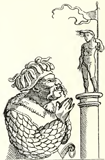
THE TURK AND HIS GOD.

He invokes protection from danger and misfortunes while journeying.