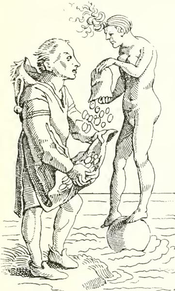
FORTUNE, THE EMPRESS OF THE WORLD.

“In private life you bear with some things in a brother-in-law