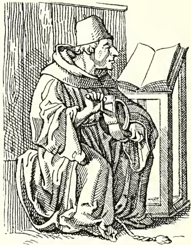
SEARCHING THE SCRIPTURES Looking for the key of knowledge and grinding out truth for others to swallow.

into the hands of Holbein while he was waiting for orders from the printer. Finding the book very amusing, he sketched his comments in pictures as he read the text.