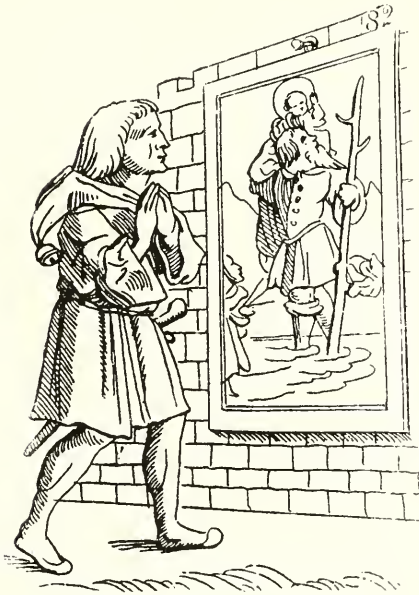
CREDULOUS PROSELYTE PRAYING TO ST. CHRISTOPHER.

“This do I leave behind me as my will and testament, where-