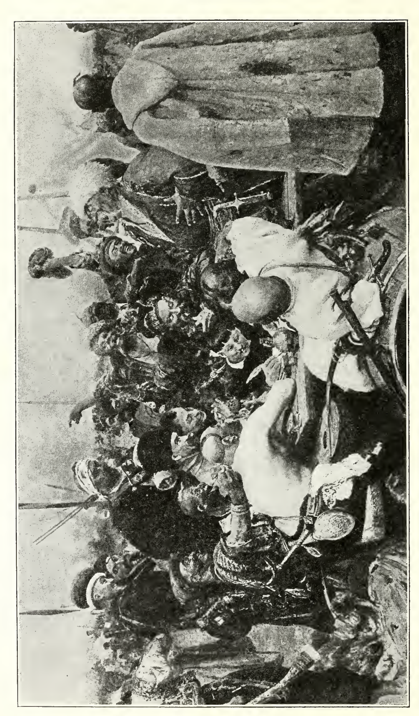
COSSACKS DICTATING AN ULTIMATUM.