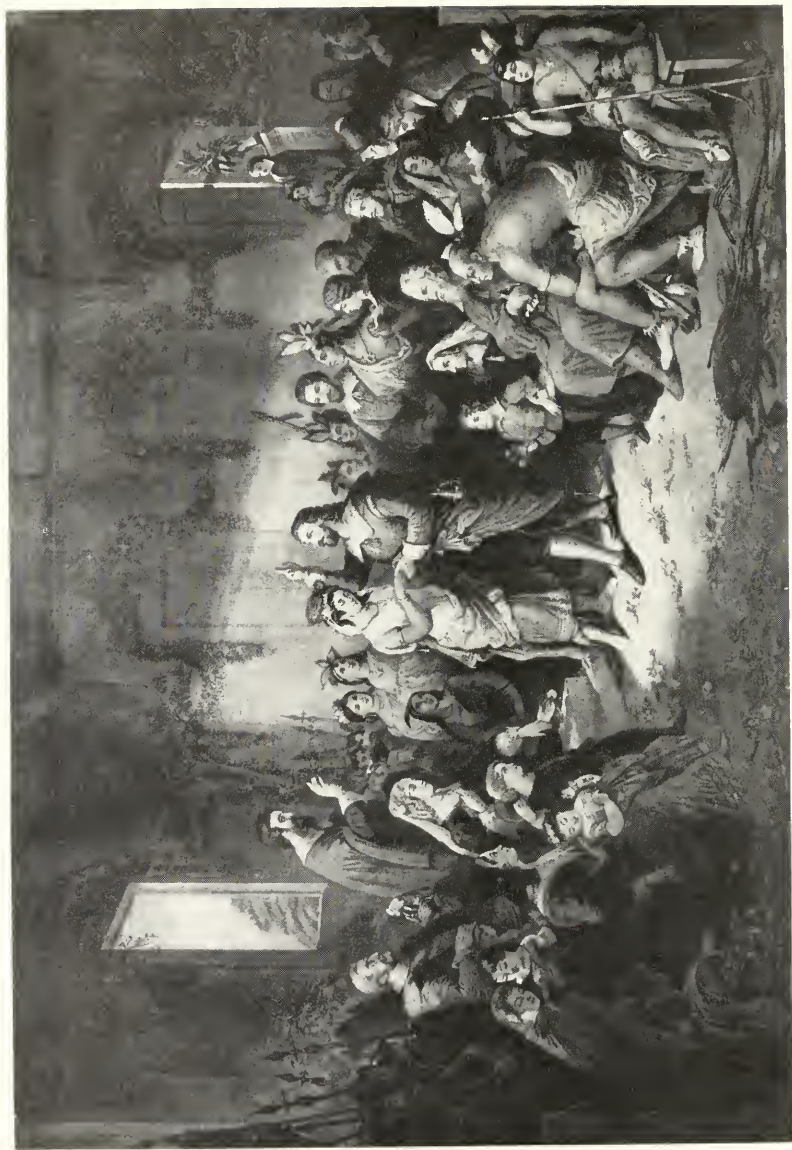
Frontispiece to The Open Court.