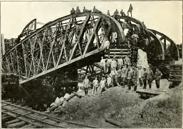
A BRIDGE IN GALICIA BLOWN UP BY THE RETREATING RUSSIANS, BEING INSPECTED BY GERMAN ENGINEERS WITH A VIEW TO RECONSTRUCTION.

When Napoleon entered upon his victorious Russian campaign in 1812, the Russians lured him into the interior as far as Moscow and followed the principle of laying waste the country so thoroughly that the invaders could