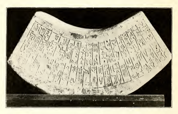
THE FOUNDATION INSCRIPTION OF NARAM SIN.

The inscription is of value for several reasons. It identifies