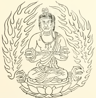
TRADITIONAL TYPES OF FUDO.