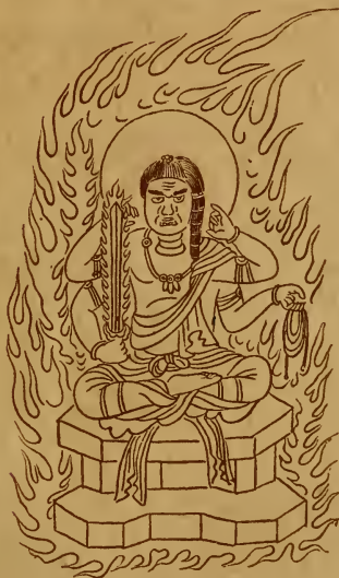
FUDO, THE JAPANESE GOD OF WILL-POWER.