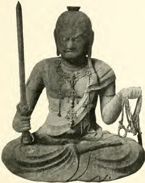
FUDO IMAGE AT KOYASAN.

Tathāgata's servant and messenger, he is engaged in various menial works. He holds a sharp sword and a rope in his hands in obedience to the Tathāgata's wrathful commands to destroy all sentient beings. 11 The rope represents the four practical methods of preaching, woven out of the heart of knowledge [ bodhichitta ]. The rope will ensnare unruly ones and keep them in check. The sharp sword of wisdom is to cut off the interminable life of karma possessed