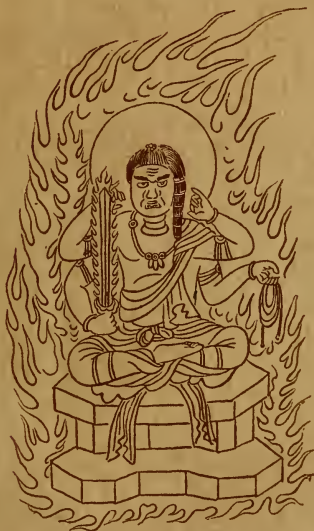
FUDO, THE JAPANESE GOD OF WILL-POWER.