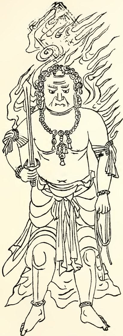
A FUDO OMAMORI.

The original was issued by a Fudō temple in Tokyo. The stamp on the top of the picture shows that it has been properly consecrated by the priest.