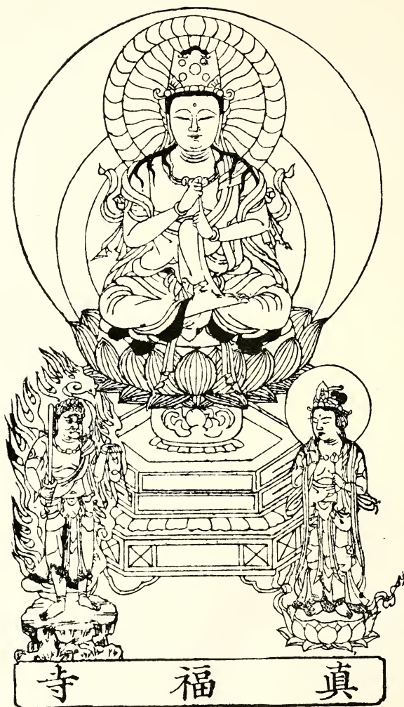
AN IMAGE OF DAINICHI (VAIROCHANA).

The Buddha is here attended by Fudō (Achala) and Kwannon (Avalokiteshvara). From the Shimpuku-ji, Kyoto.