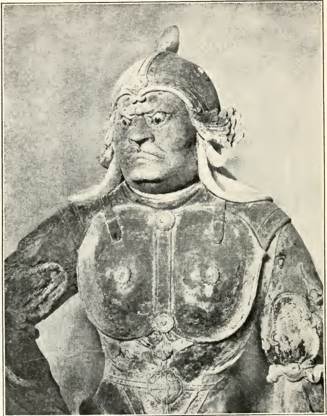
JIKOKUTEN, GUARDIAN OF THE EAST.

From a terra cotta in the Todaji temple at Nara (8th century).