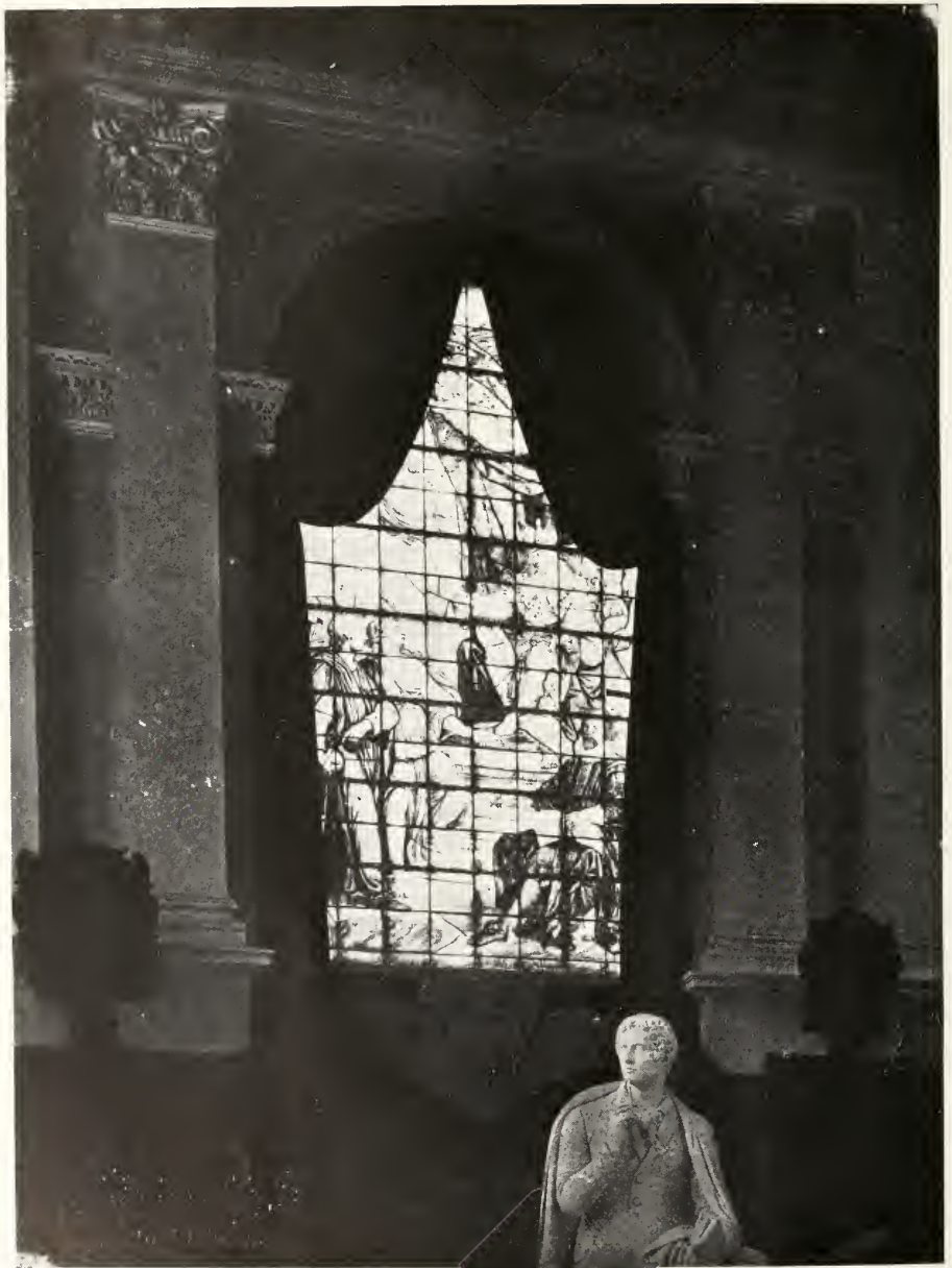
THE NEWTON WINDOW IN TRINITY COLLEGE, CAMBRIDGE.