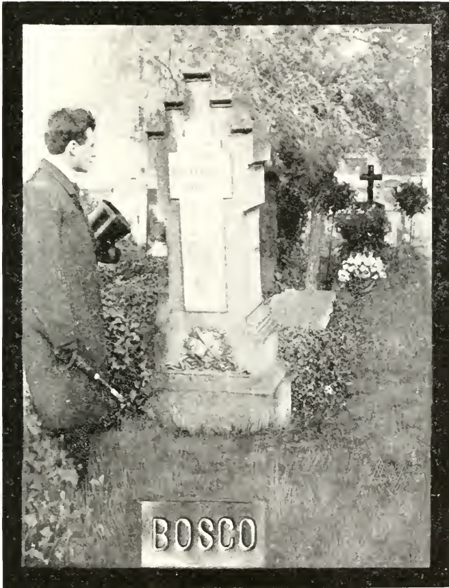
HOUDINI AT THE GRAVE OF BOSCO.

"After making a majestic bow to his audience, the celebrated conjurer walked silently and with measured steps up to the famous copper ball. After convincing himself it was solidly hung, he took up his wand, which he wiped with a white handkerchief, as if to re-