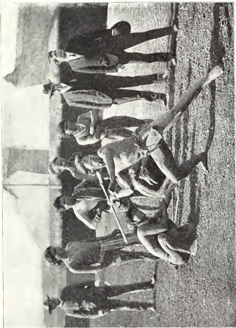
THROWING THE SPEAR.

transition many changes will be so subtle that they may become imperceptible to the Igorotes themselves, and so even their own information will after a few years have to be suspected as influenced by a new interpretation