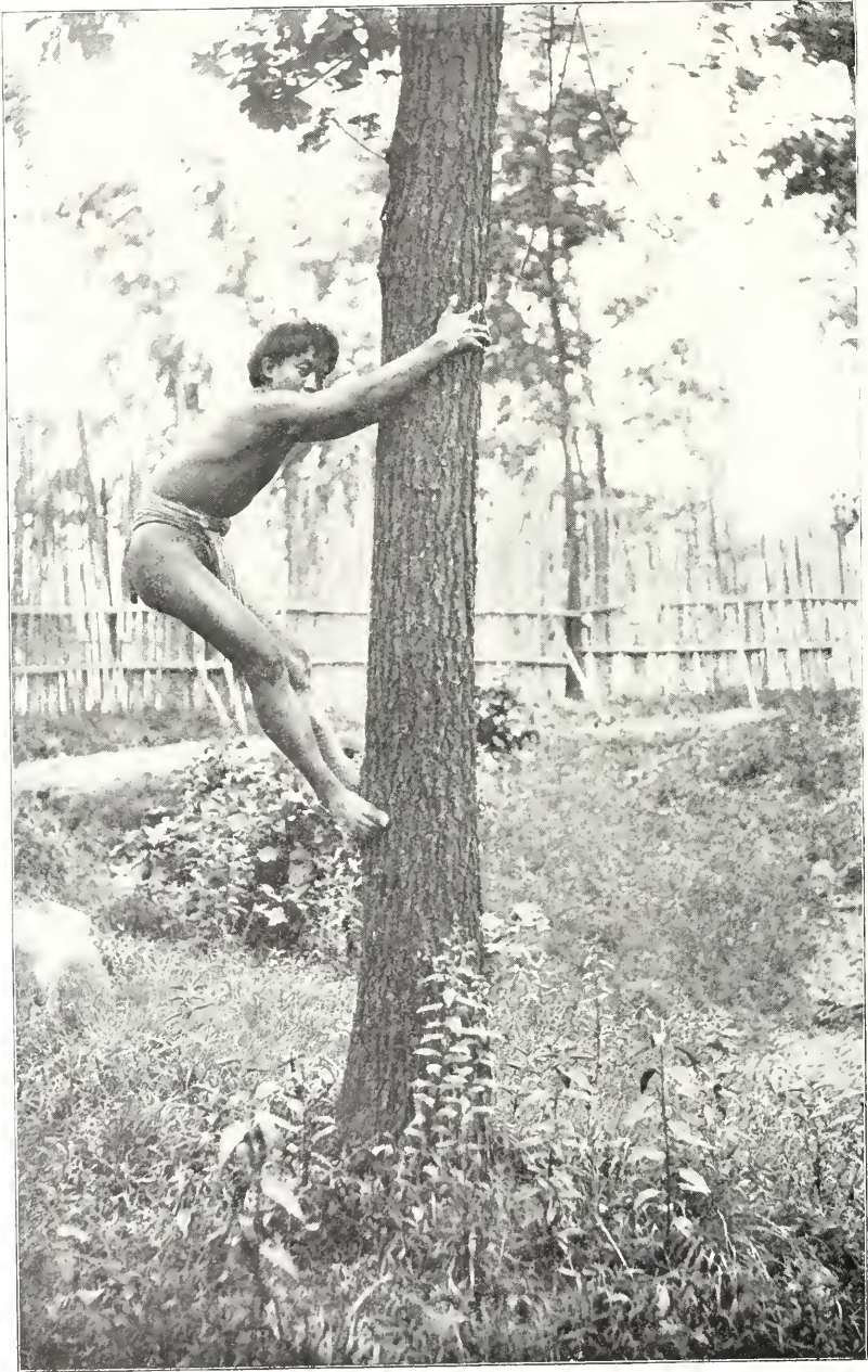
CLIMBING A TREE.