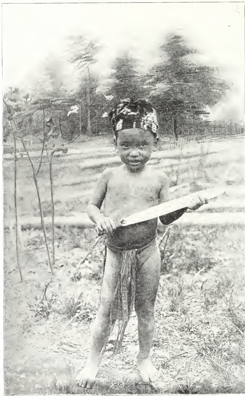
THE LITTLE SWORDSMAN.