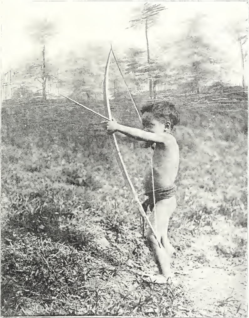
THE LITTLE ARCHER

While to all appearances the Igorotes are savages and range very low in the scale of civilisation they are not lacking in mentality, and it is probable that they will make rapid progress under the beneficial influence of United States institutions. Their old habits will die out within two or three