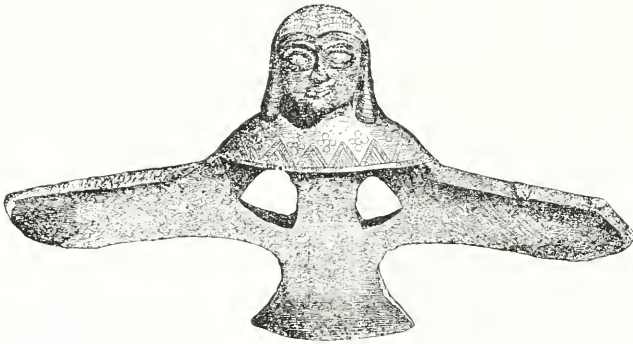
FRONT VIEW OF AN ASSYRIAN REPRESENTATION OF THE SOUL. Ancient bronze figure found at Van. (After Lenormant, L'histoire de l'Orient , Vol. IV, pp. 124 and 125.)

"The Assyrians seem to have imagined the soul like a bird with shining wings rising to the skies. It is curious that they