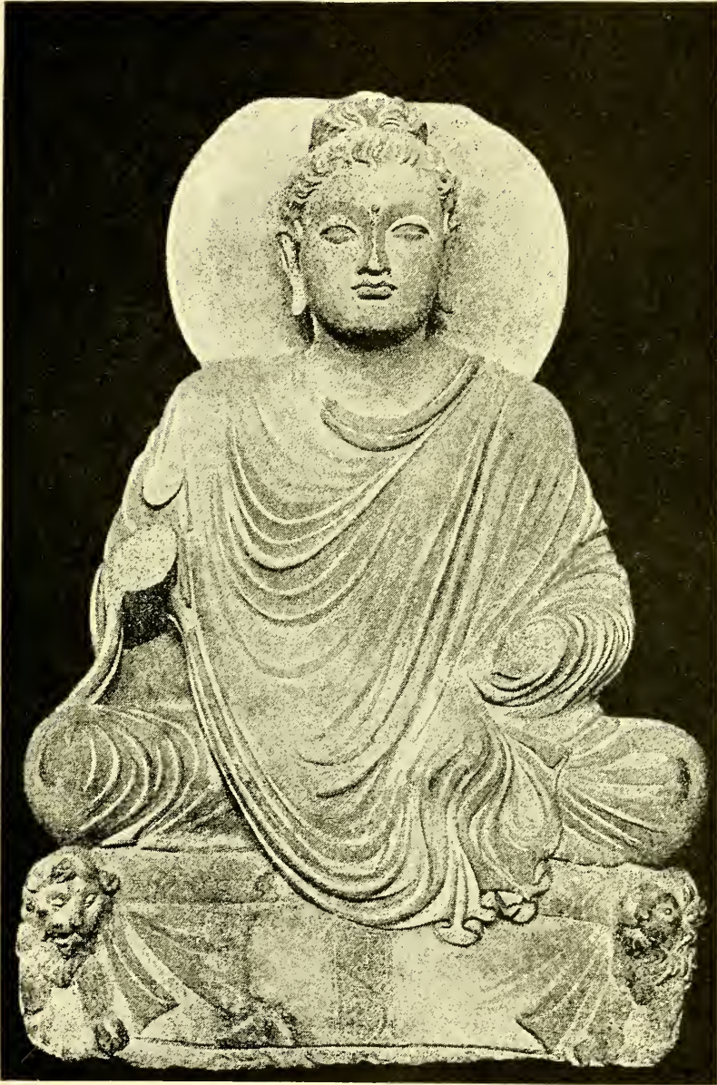
THE GANDHARA STATUE. (SECOND CENTURY B. C.) Perhaps the most ancient statue of Buddha still in existence.