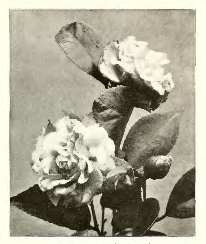
CAMELLIA JAPONICA (EIGHT-FOLD)

The art of flower arrangement in Japan is a great accomplishment, and the theory of it is quite complex. The basal idea is simple, for the Japanese do not believe in such a massing of various colors and of different flowers, branches, grasses, etc., as is needed