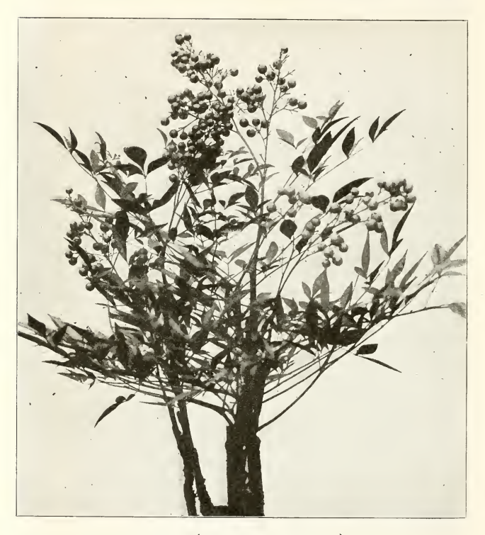
NANTEN (NANDINA DOMESTICA). This plant is frequently used in winter for flower arrangement, when there are scarcely any hanas available.

The whole theory of Japanese flower arrangement depends