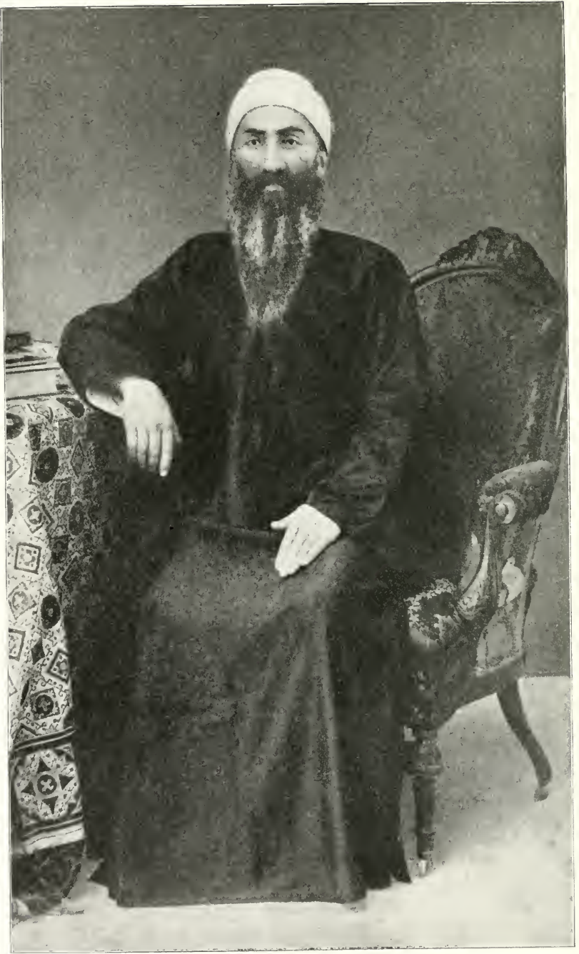
MOUSA EFFENDI, EL KALEEM. THE ELDEST BROTHER OF BEHA ULLAH.*

*Mousa means "Moses," and El Kaleem "Speaker With God."