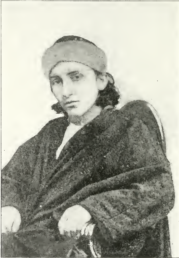
A PREACHER OF BEHAISM.

“He does not permit his family to have luxuries. He himself eats but once a day, and then bread, olives, and cheese suffice him.