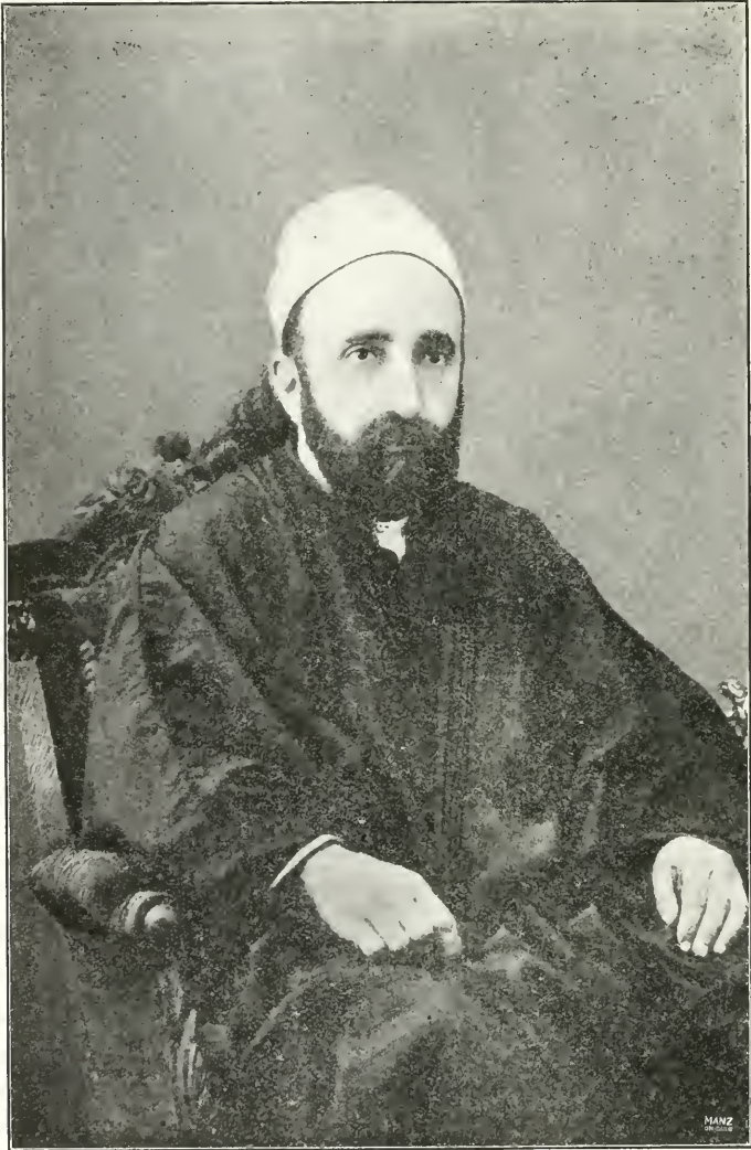
MUHAMMAD-ALI EFFENDI. Gusn-i-Akbar (The Mightiest Branch). Taken 1900.

of its Founder's words, such as the theories of 'racial supremacy,' 'imperial destiny,' 'survival of the fittest,' and the like, grows steadily more rather than less material. Did Christ belong to a 'dominant