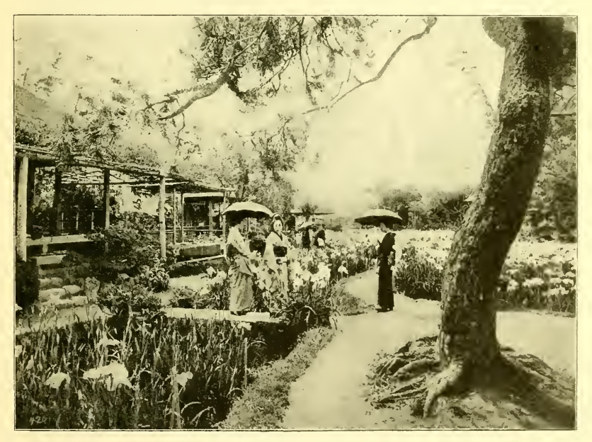
THE IRIS AT HORIKIRI, TOKIO.

OF the iris there are several Japanese varieties, known as ayama hanashobu, kakitsubata, shaga, etc. In Tokyo the most famous show of this flower is at Horikiri, "where in ponds and