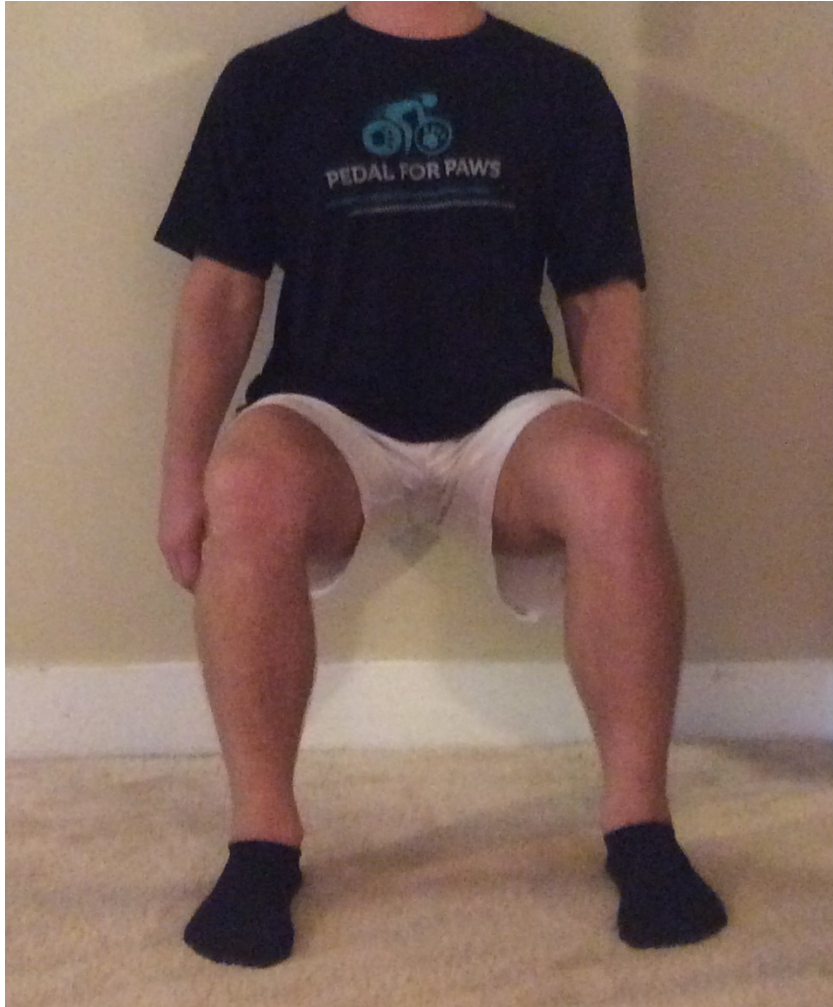
FIGURE 1 Wall Sit. Proper wall position while wearing socks on a carpeted floor with feet flat, knees at 90 degrees, and arms hanging down.

For this experiment failure was defined as a 5 degree deviation from the 90 degree knee angle. All participants performed the experiment in athletic shorts and socks without shoes on. The task was completed on a carpeted floor. Participants were instructed to look straight ahead throughout the duration of the trial. A within-participant design was used with each participant participating in all three experimental conditions; internal, external, and control. Each trial was separated by at least 48 hours. This was to ensure adequate recovery time by eliminating the