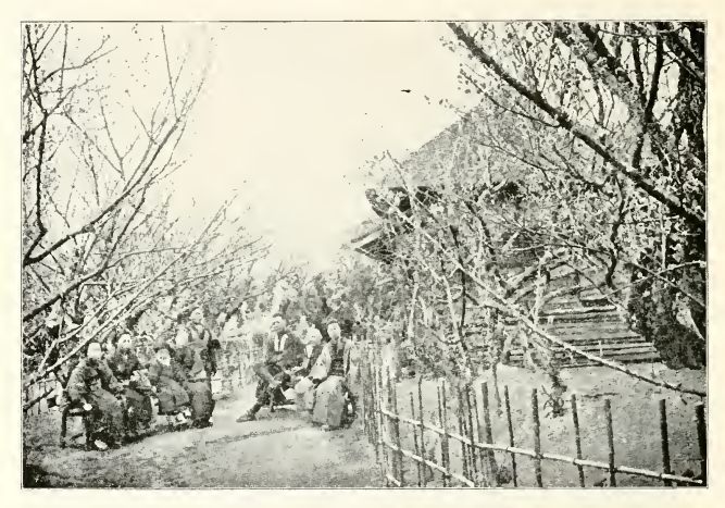
A VIEW IN THE RECUMBENT-DRAGON-PLUM GARDEN.

There are said to be sixty different species of plum-trees in Japan. To go and see that blossom is a most delightful pastime and holiday. "Often one sees visionary old men sitting lost in reverie, and murmuring to themselves of ume-no-hana, the plum-blossom. They sip tea, they rap out the ashes from tiny pipes, and slipping a writing-case from the girdle, unroll a scroll of paper, and indite an ode or sonnet. Then with radiant face and cheerful muttering, the ancient poet will slip his toes into his clogs, and tie the little slip to the branches of the most charming tree." According to a Japanese poem, "the sight of the plum-blossom causes the ink to flow in the writing-room."