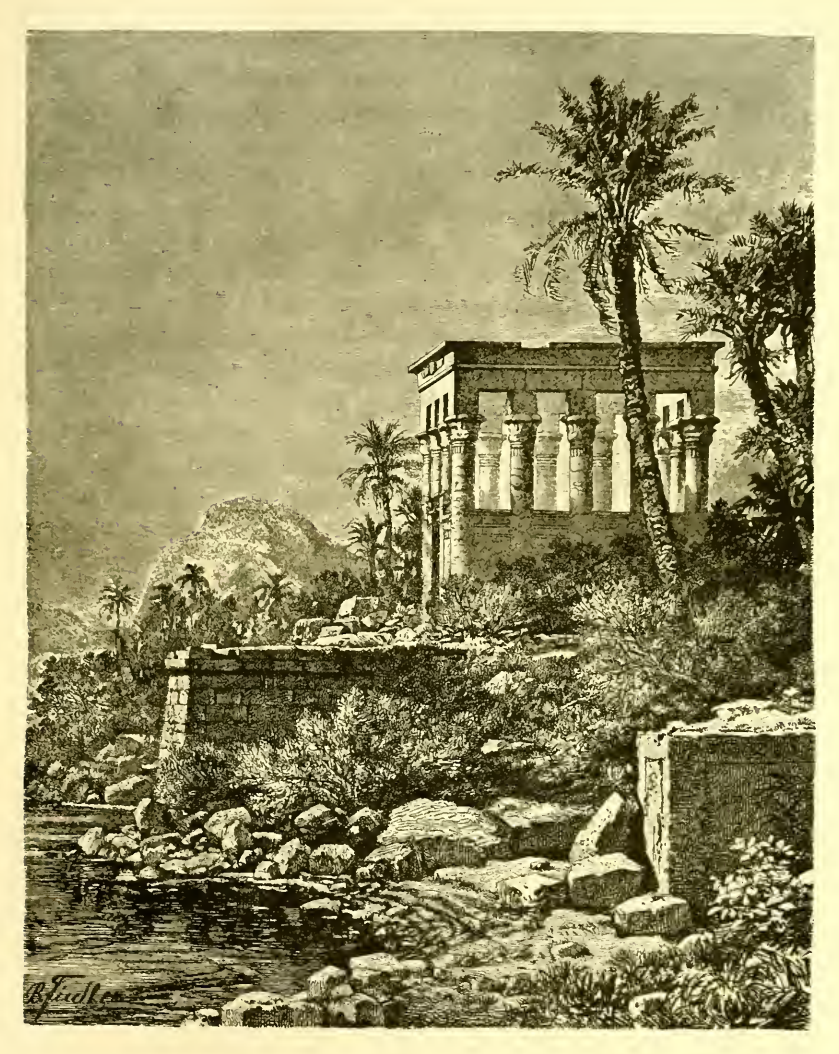
KIOSK OF PHILE, FROM THE NORTH.

times inhabited by savage tribes. The southern trade of the Egyptian inhabitants of Elephantine suffered much from depradations until the kings of Egypt decided to establish their authority in this part of the country, and King Usirtasen I. of the twelfth dynasty