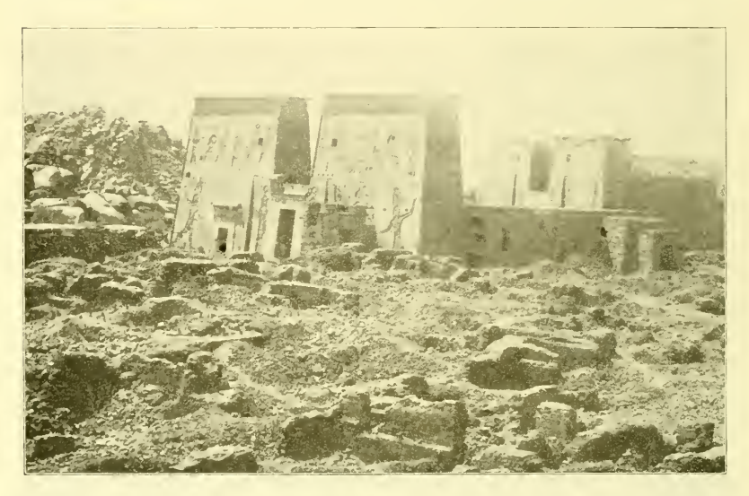
THE TEMPLE OF ISIS. - PANORAMA

And, indeed, the island has always been famous for the peculiar charm of its fairy tale atmosphere. Under the cloudless sky of Egypt it lay like a green emerald, all the more precious by the contrast to the bare gray rocks which surrounded its northern shore. As a gem is set on a silver foil, so it rises from the shining current