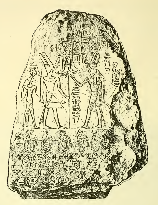
KING USIRTASEN'S STELE OF WADY HALFA.