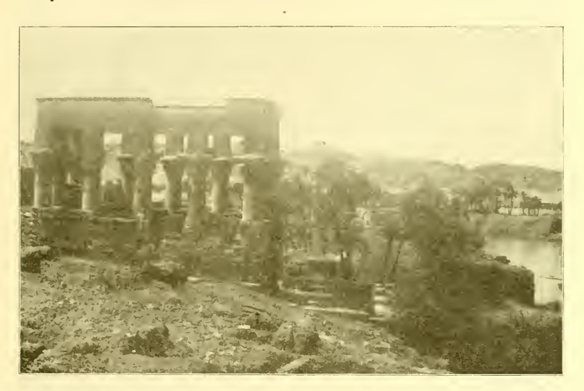
OF PHILE -THE KIOSK.

has there changed the valley of the river into a broad lake. A number of villages which dotted the banks are inundated, and one of the most sacred spots of pagan worship which has been visited by millions of worshippers in ancient days and remained down to modern times the goal of many thousands of curious travellers, scholars, and archæologists, is now fast becoming a booty of the floods. The water of the Nile now laves the columns of the temple walls, and the moisture creeps up to the mural paintings. It is only a question of time when they will be destroyed entirely and when the stones themselves will be underwashed and crumble away.