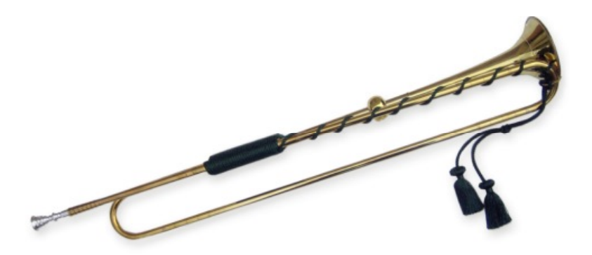
Figure 1. Natural Trumpet<sup>3</sup>

serpent, sackbut, lur, vuvuzela, didgeridoo, alphorn, and the cornetto or zink. All of these instruments are somewhat crude or unrefined in comparison to modern day brass instruments. They are similar in that they all create sound by initiating a column of air resonating through the vibration of the lips. It was not until the early sixteenth century that we began to see the valveless, keyless, vent-less natural trumpet.