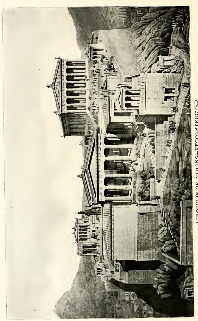
ACROPOLIS OF ATHENS—RECONSTRUCTED.