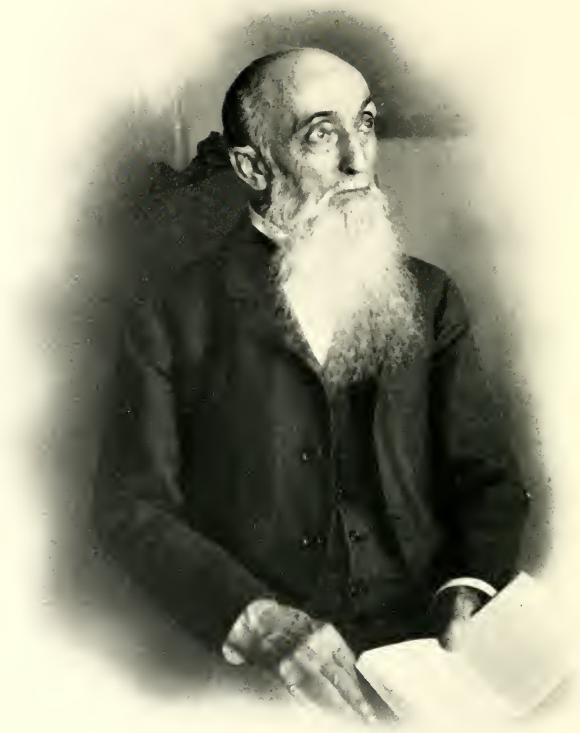
CHARLES CARROLL BONNEY.