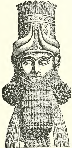
Fig. 17. HORNS THE EMBLEM OF STRENGTH.

It seems to me that exaggerations should be avoided in either direction. I have never ceased to emphasise the "crass" polytheism of the Babylonians, and am far from feeling obliged to disguise it. But I regard it as just as much out of place to make the Sumerian-Babylonian pantheon and its representation in poetry, particularly in popular poetry, the butt of shallow wit and sarcastic exaggerations, as we should properly condemn such ridicule if directed at the gods of Homer. Nor should the worship of divinities in images of wood or stone be in any wise glossed over. Only it should not be forgotten that even the Biblical account of creation has man created "in the likeness of God," in diametrical contradiction of the constantly emphasised "spirituality" of God,—as has rightly been