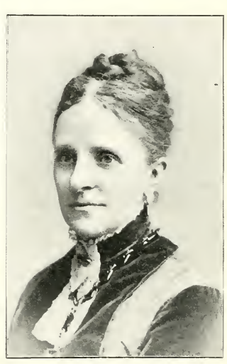
THE WIFE. After a photograph.

opportunity to admire his extraordinary administrative ability and the tact which he displayed. The crown and glory of all the congresses was the Parliament of Religions which was an unprecedented event in history and which became possible only through the extraordinary discretion with which the delegates of the several creeds and sects were treated.