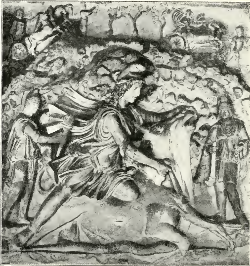
GRAND BORGHESI BAS-RELIEF. (Louvre.)

their attitudes and vestments. But these defects should not render us oblivious to the delicacy of the work here performed with a crumbling material, and especially to the praiseworthy success with which a conception of real grandeur has been realised. To attempt to represent on stone not only the gods but the cosmogony of the Mysteries and the episodes of the legend of Mithra, even to the final immolation of the bull, was an undertaking attended with great perils and is a meritorious achievement even in partial success. Even prior to this date, and particularly on the sarcophagi,