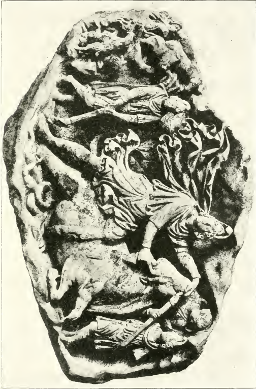
FIG. 2. BAS-RELIEF OF AQUILRID.

tive symmetry resulting from the fact that the two figures, which are intended as counterparts, have both their mantles fastened at the right shoulder and falling down at the right side.