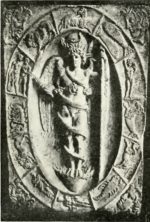
Fig. 3. MITHRAIC KRONOS, OR PERSONIFICATION OF INFINITE TIME.

three clearly marked classes may be distinguished. Some of the figures have been borrowed outright from the traditional types of Græco-Roman art. Ahura Mazda destroying the monsters that had risen against him is a Hellenic Zeus annihilating the giants with his bolts; Verethragna is transformed into a Hercules; Helios is