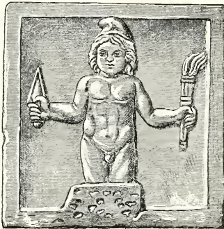
Fig. 4. MITHRA BORN FROM THE ROCK. Bas-Relief found in the Crypt of St. Clements at Rome.

On the other hand, one personage at least is a transformation of an Asiatic archetype; this is the leontocephalic, or lion-headed, Kronos (see Fig. 3). Like the majority of his compeers, this animal-headed monster is a creation of the Oriental imagination. His genealogy would doubtless carry us back to the period of Assyrian sculpture. But the artists of the Occident, having to represent a deity entirely strange to the Greek Pantheon, and being un-