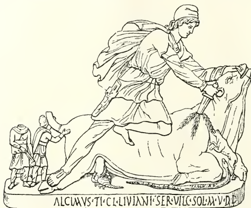
Fig. 1. TAUROCTONOUS MITHRA. Marble Group in the British Museum.

in imitation of the sacrificing Victory which adorned the balustrade of the temple of Athena Nike on the Acropolis. Certain marbles discovered at Rome and at Ostium (see Fig. 1), which unquestionably go back to the beginning of the second century, still reflect the splendor of the powerful compositions of the Hellenistic epoch. After an ardent pursuit, the god captures the bull, which has fallen to the earth; with one knee on its croup and his foot on one of its hoofs, he bears down upon it, pressing it against the earth; and grasping it by the nostrils with one hand, with the other he plunges a knife into its flank. The impetuosity of this animated scene throws in high relief the agility and strength of the invincible hero. On the other hand, the suffering of the moribund victim gasping