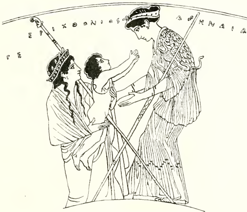
Fig. 5. BIRTH OF ERICHTHONIOS. From a Greek Vase.

grace, its unwonted aspect and the suggestive accumulation of its attributes awakened curiosity and provoked reflection. With the exception of this god of Time, we can establish the Oriental origin of certain emblems only, like the Phrygian bonnet topping a staff, or the sphere surmounted by an eagle representing the Heavens. As the Mithra immolating the bull, so also the other scenes in which this hero appears as actor, are unquestionably in greater part the transpositions of motifs popular in the Hellenistic epoch, although we are unable in every case to rediscover the original which the Roman marble-cutter imitated or the elements which he combined in his composition. As for the rest, the artistic value of these