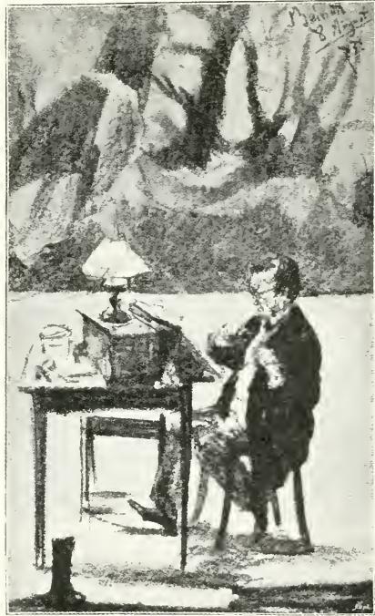
RICHARD WAGNER AT THE REHEARSAL.

these achievements to the world and saw them treated with coldness by the public and contempt by the critics, he began to despair. As the beautiful vision vanished, his serene optimism was superseded by a sullen pessimism; in this despondent state of mind he heard the censorious voice of the misanthropic sage of Frankfort exclaiming: "Vain man, do you think your fate is exceptional? Solitude and disparagement are the penalties of genius; suffering is the universal lot of man; pessimism is not a transient mood, but