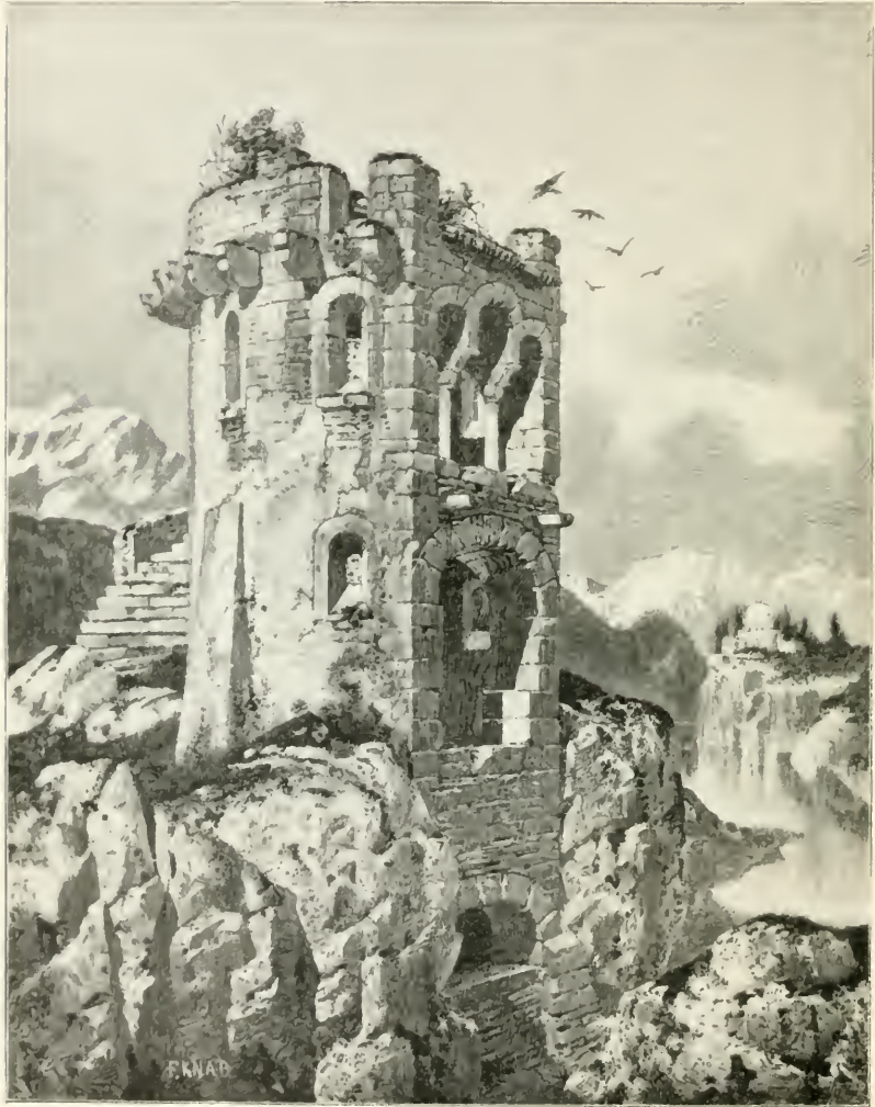
TOWER OF THE MAGICIAN KLINGSOR.

him, is pervaded by a correspondingly cheerful spirit. It is a quasi-historical comedy with a distinctly polemical purpose, in which the Minnesinger Walther von Stolzing and the Mastersinger