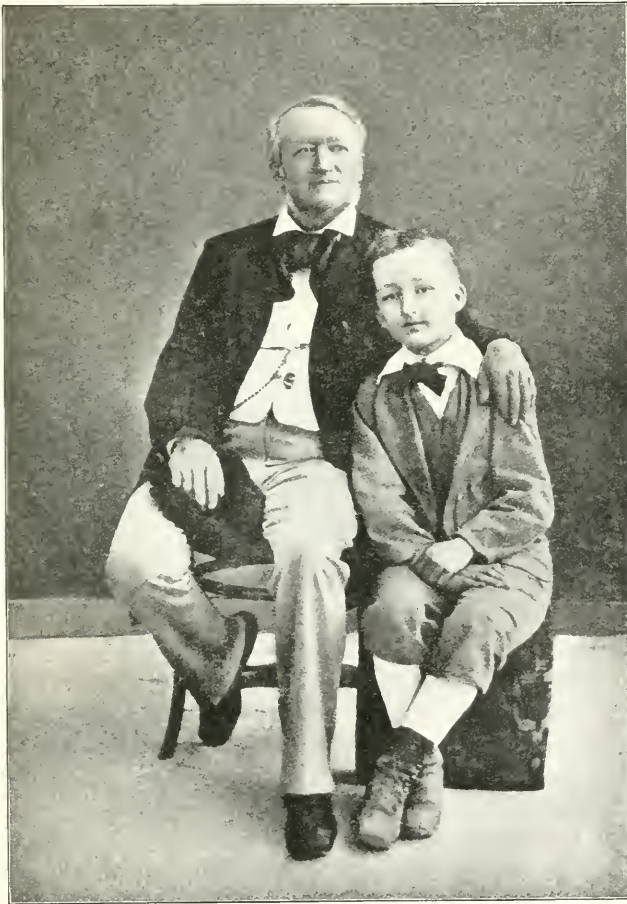
RICHARD WAGNER AND SIGFRIED WAGNER.

gether and fell into conversation concerning the scandalous gossip that was being circulated to their injury, the former remarked that he should pay no attention to it or at least should wait until he was accused of stealing silver spoons; whereupon Goethe replied that he should give no heed to it even then. Wagner refers to