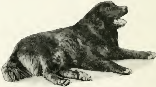
WAGNER'S DOG Marke .