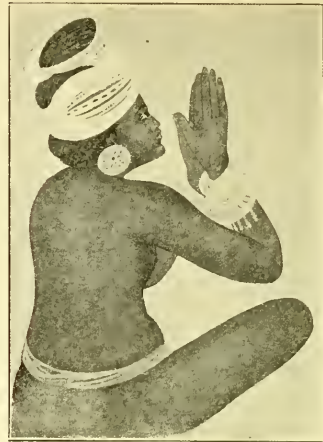
TYPES OF WORSHIPPERS. (Ajanta caves.)