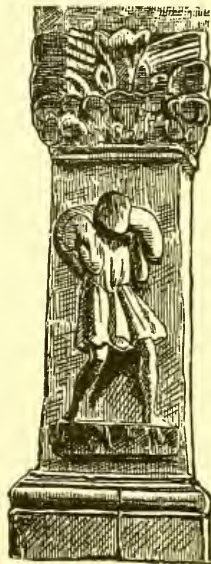
LAMB-BEARER IN THE GANDHĀRA SCULPTURES.