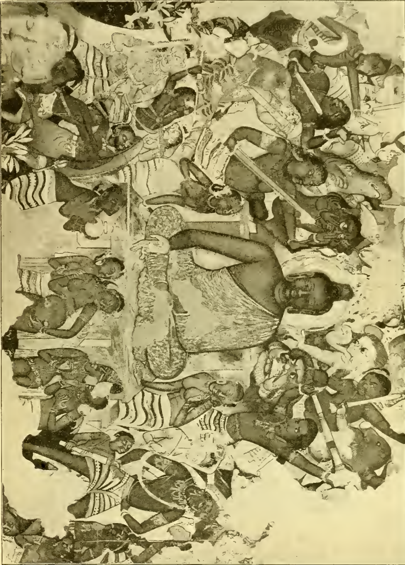
THE TEMPTATION. (From Scenes in the Life of Buddha in the Ajanta caves.)

“Mr. Fergusson, who visited the caves in 1838–1839, wrote: