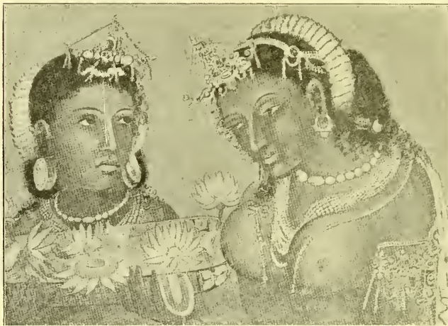
NOBLE WOMEN WITH FLOWER OFFERINGS. (Ajanta caves.)

Chinese art, particularly in the flatness and want of shadow. I never, however, in China saw anything approaching its perfection.'