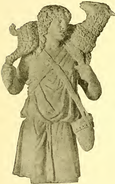
THE GOOD SHEPHERD OF THE LATERAN. 2