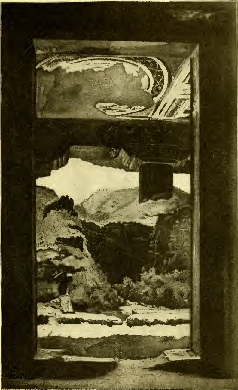
VIEW FROM A GALLERY IN THE AJANTA CAVES.