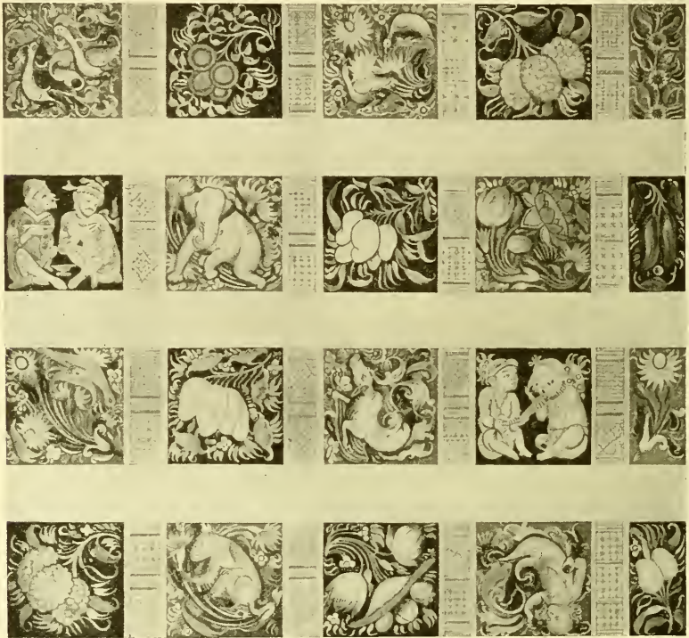
SAMPLE OF CEILING-DECORATIONS. (Ajanta caves.)

We here reproduce a general map of the site of the place with its twenty-eight chaityas (i. e., churches or assembly rooms), surrounded by cells and having ornamental portals and verandas. They are fast falling into decay and only part of their wall decorations have been preserved in Griffith's valuable two-volume édition de luxe , from which we here reproduce a few of the most interesting pictures.