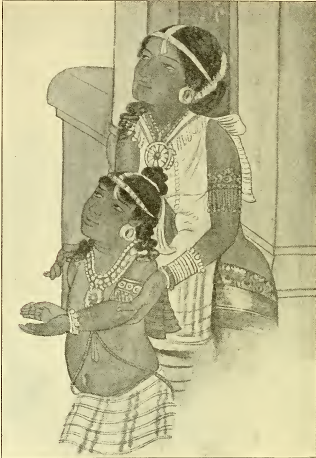
A MOTHER LEADING HER CHILD TO BUDDHA. (Ajanta caves.)

The monastic life described in the first, second, and fifth chapters of the story Amitâbha is a faithful portrayal of the historical conditions of the age. The admission and ordination of monks (in Pâli called Pabbajja and Upasampada) and the confession ceremony (in Pâli called Uposatha) are based upon accounts of the Mahâvagga, the former in the first, the latter in the second, Khandaka (cf. Sacred Books of the East , Vol. XIII.).