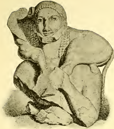
THE CALF-BEARING HERMES. Archaic Prototype. (From Baumeister, Denkm. des cl. Alt. )