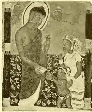
A CHILD OFFERING GIFTS TO BUDDHA. (Fresco in the Ajanta caves. 1 )