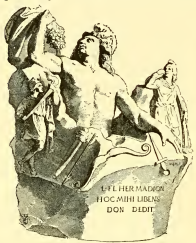
Fig. 1 a. MITHRA BORN FROM THE ROCKS.

THE god with whom Mithra first measured his strength was the Sun. The latter was compelled to render homage to the superiority of his rival and to receive from him his investiture. His