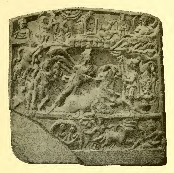
Fig. 3. Bas-Relief of Apulum, Dacia.

causing a protracted drought, and its inhabitants, tortured by thirst, implored the aid of his ever-victorious adversary. The divine archer discharged his arrows against a precipitous rock and there gushed forth from it a spring of living water to which the suppliants thronged to cool their parched palates. But a still more terrible cataclysm followed, which menaced all nature. A universal deluge depopulated the earth, which was overwhelmed by the waters of the rivers and the seas. One man alone, secretly