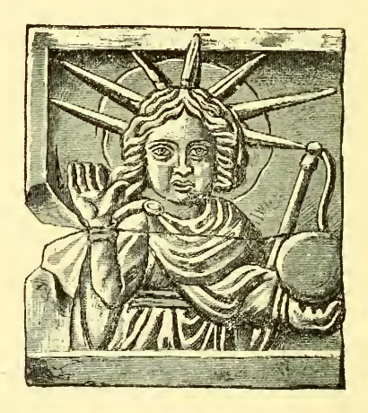
Fig. 1b. Sol the Sun-God Installed by Mithra as the governor of the world. To the right the globe of power.

Holding in his hand the grape which replaces in the West the Haoma of the Persians.