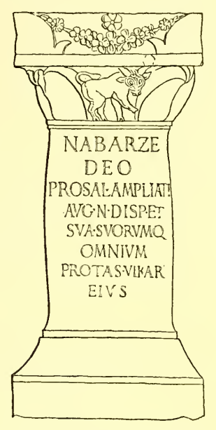
Fig. 4. DEDICATORY INSCRIP-TION OF MITHRA NABAR-ZES (VICTORIOUS). Found at Sarmizegetusa.

In the war which the zealous champion of piety carries on unceasingly with the malign demons, he is assisted by Mithra. Mithra is the god of help whom one never invokes in vain, an unfailing