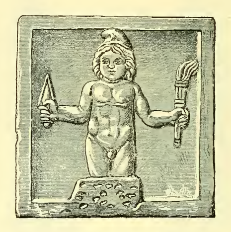
Fig. 6. MITHRA BORN FROM THE ROCK. Bas-Relief found in the Crypt of St. Clements at Rome.

enigmatic epithets of Cauti and Cautopati , and were naught else than the double incarnation of his person (Figs. 4 and 5). These two dadophori, as they were called, and the tauroctonous hero formed together a triad, and in this "triple Mithra" was variously seen either the star of day, whose coming at morn the cock announced, who passed at midday triumphantly into the zenith and at night languorously fell toward the horizon; or the sun which, as it waxed in strength, entered the constellation of Taurus and marked the beginning of spring,—the sun whose conquering ardors fecundated nature in the heart of summer and the sun that afterwards, enfeebled, traversed the sign of the Scorpion and announced the return of winter. From another point of view, one of these torch-