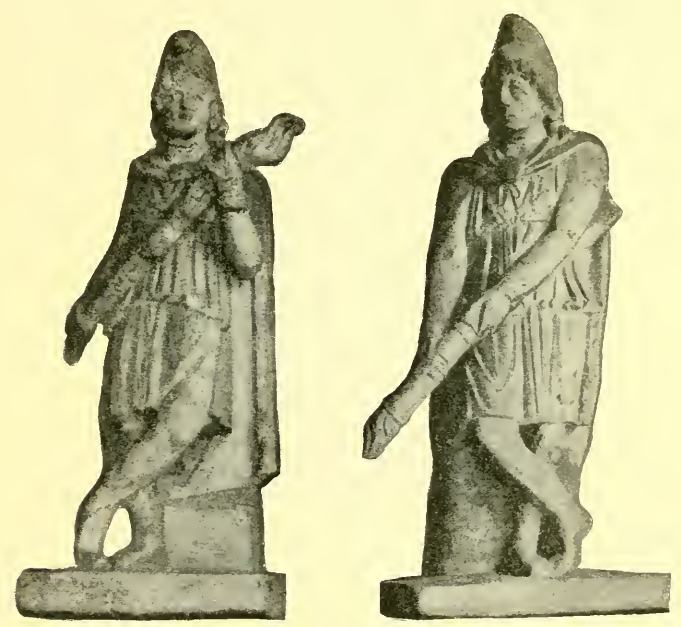
Fig. 5. Statues of Torch-Bearers. (Museum of Palermo.)

this attribute in the ritual, the sixteenth or middle day of each month was consecrated to him. When he was identified with Shamash, his priests in investing him with the appellation of "intermediary" doubtless had in mind the fact that, according to the Chaldæan doctrines, the sun occupied the middle place in the planetary choir. But this middle position was not exclusively a position in space; it was also invested with an important moral significance. Mithra was the "mediator" between the unapproachable and unknowable god that reigned in the ethereal spheres and the human race that struggled and suffered here below. Shamash