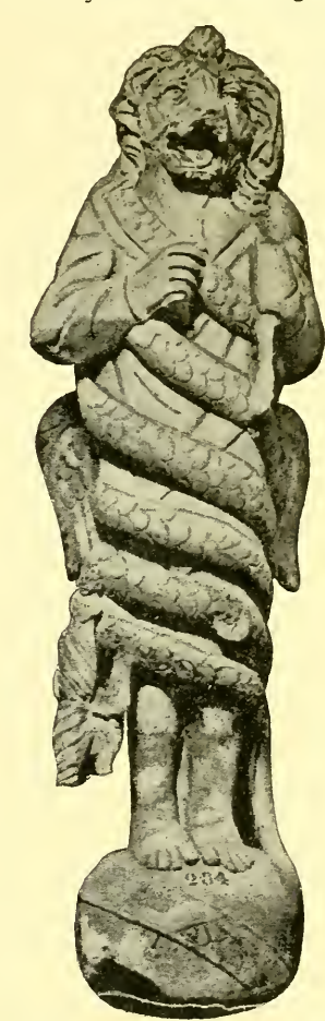
Fig. 2. MITHRAIC KRONOS OF FLORENCE.<sup>2</sup>

things, the Mithraic theology, the heir of that of the Zervanitic Magi, placed boundless Time. Sometimes they called it Aἰών or