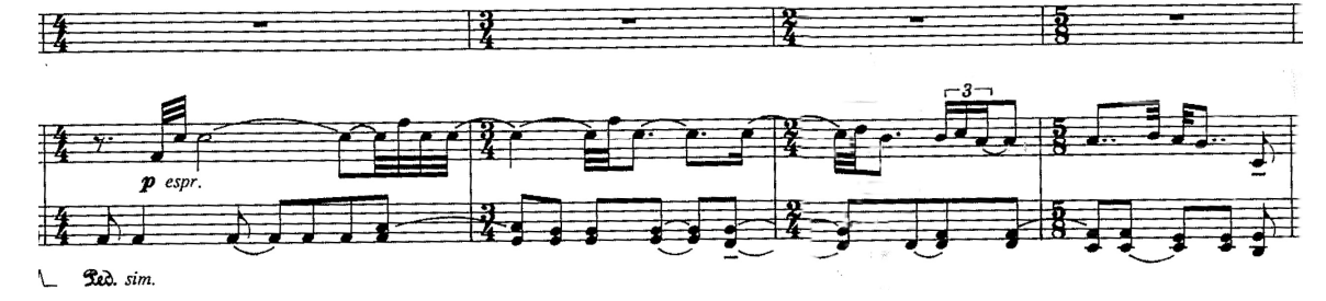
Figure 2.4- Variation 1, with the chaconne theme in the left hand

Albright's formal structure is based on the follia, a "musical pattern used during the Baroque era as a basis for songs, dances, and variation sets. The original follia, however, was a popular dance in late 15<sup>th</sup>-century Portugal; the term meant 'mad' or 'empty-headed.'"<sup>28</sup> According to Utley, the follia that Albright is trying to imitate "came to represent a chord progression," and although Albright's version is "harmonically slightly different," they are both similar in their "general movement from tonic to a dominant function chord … [and] the use of ties and delayed resolutions"<sup>29</sup> which are present through each version of the bass line. The chaconne is a four bar phrase which repeats twenty-three times through the movement. Usually it uses a shifting time signature: one bar of 4/4, one bar of 3/4, one bar of 2/4, and one bar of 5/8. Utley groups the variations into five sections of between three and seven variations based on how the groups of variations are composed and arranged.