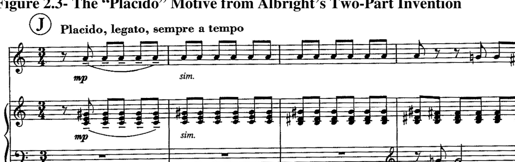
Figure 2.3- The "Placido" Motive from Albright's Two-Part Invention

One other motive that is worth noting is what Utley calls the Placido motive (see Figure 2.3), heard in two episodes at (\mathbf{J}) and four bars before (\mathbf{O}) . This motive is distinctly different from the other motives of this movement, extremely smooth and legato, played at a lower dynamic, and characterized almost entirely by half-steps as opposed to the extreme registral leaps in the rest of the movement. The chords, repeated in constant eight notes in both voices, gradually descend chromatically.