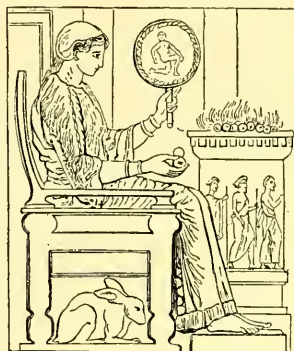
APHRODITE WITH EASTER RABBIT.

It appears that Sunday was the day of religious communion among the Gnostics, the Therapeutae and kindred sects who believed in the new dispensation, and the day may have been chosen under Mithraic influence. We must remember that the Nazir sect,