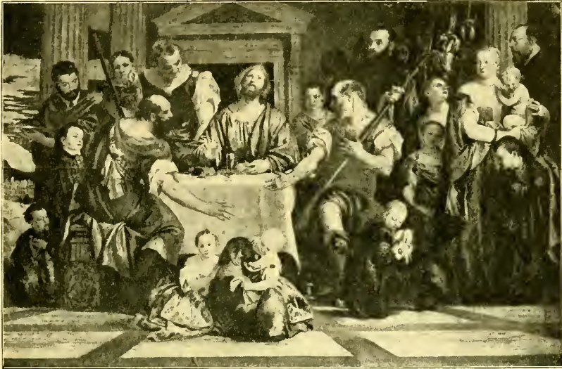
CHRIST AMONG THE DISCIPLES OF EMMAUS.

Perhaps the most beautiful conception of the risen Christ (incomparably nobler than the crude materialistic notion of a corporeal